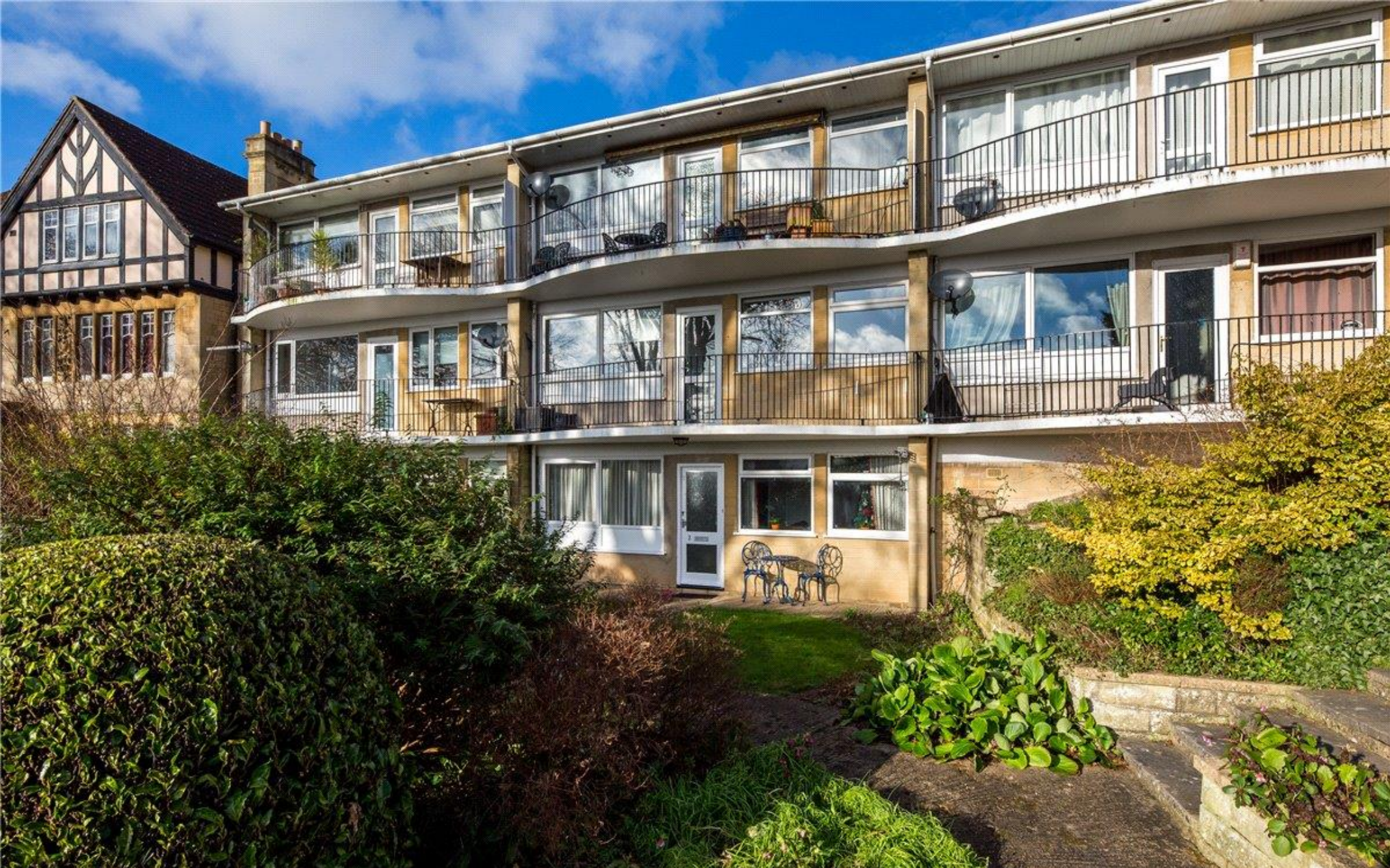
LANDSDOWN GROVE COURT Bath