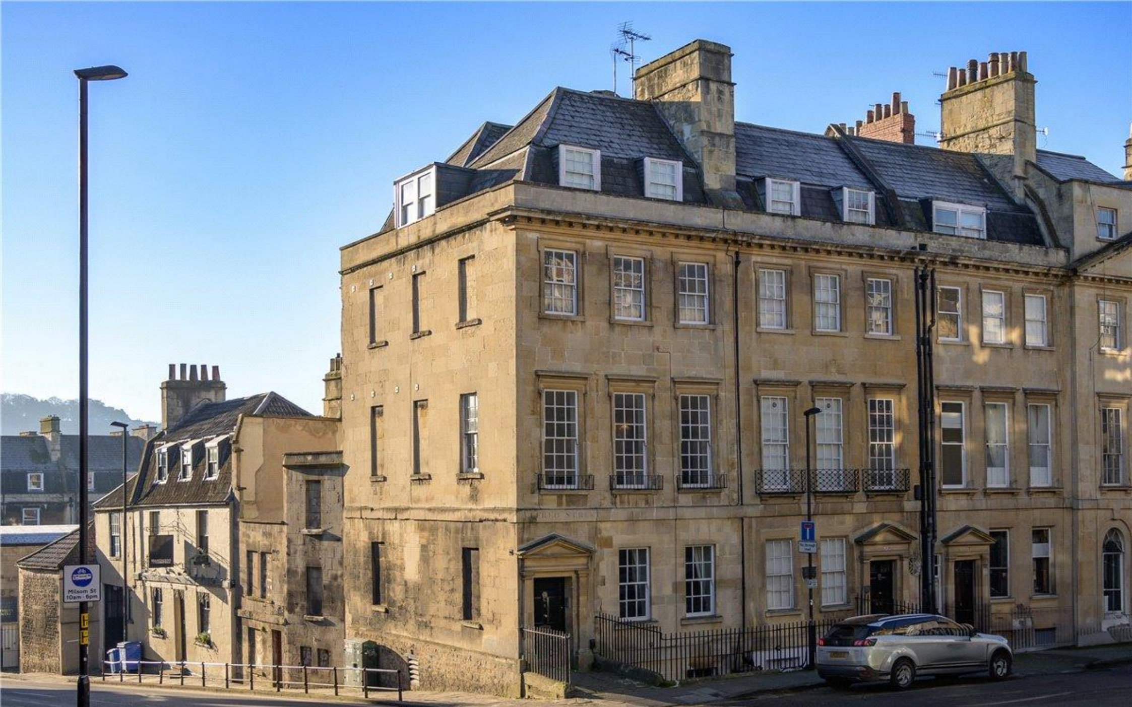
ALFRED STREET Bath