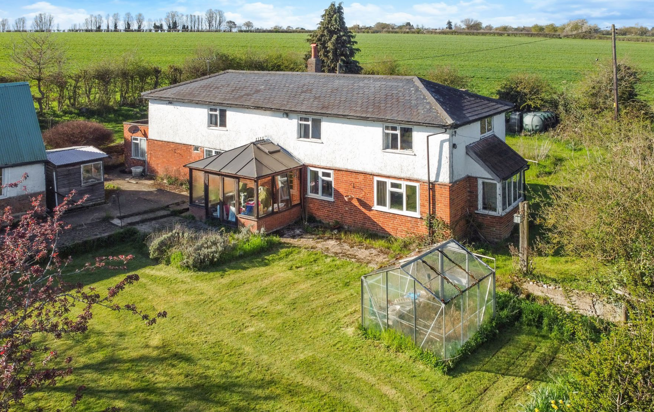
BURNT HOUSE Water End, Ashdon