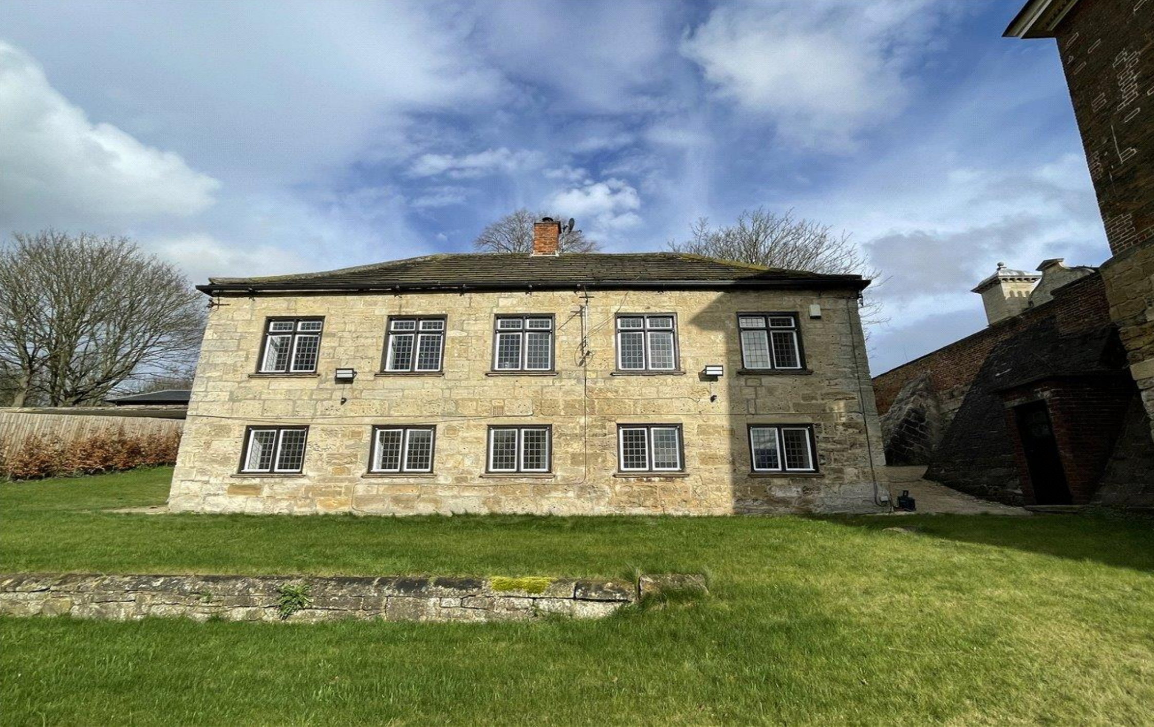
THE BOTHY, LEDSTON HALL, BACK NEWTON LANE, LEDSTON, CASTLEFORD, WF10 2GP £1,600 per month