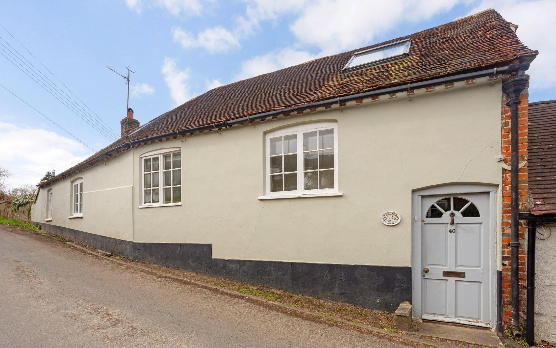
THE OLD SCHOOL HOUSE, FROXFIELD