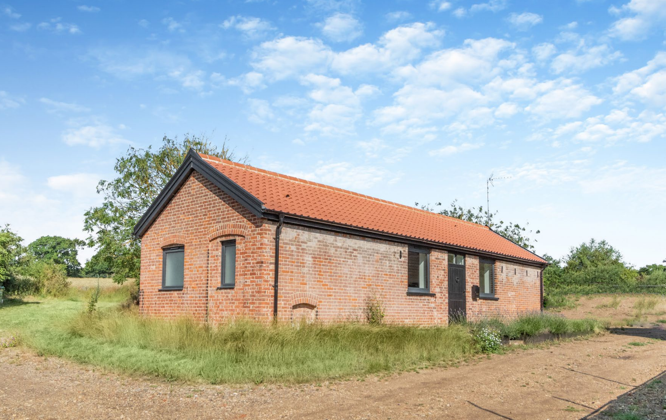
THE STABLES Colne Engaine, Essex