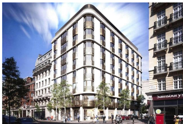
Classification L2 - Business Data