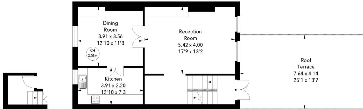
First Floor Entrance