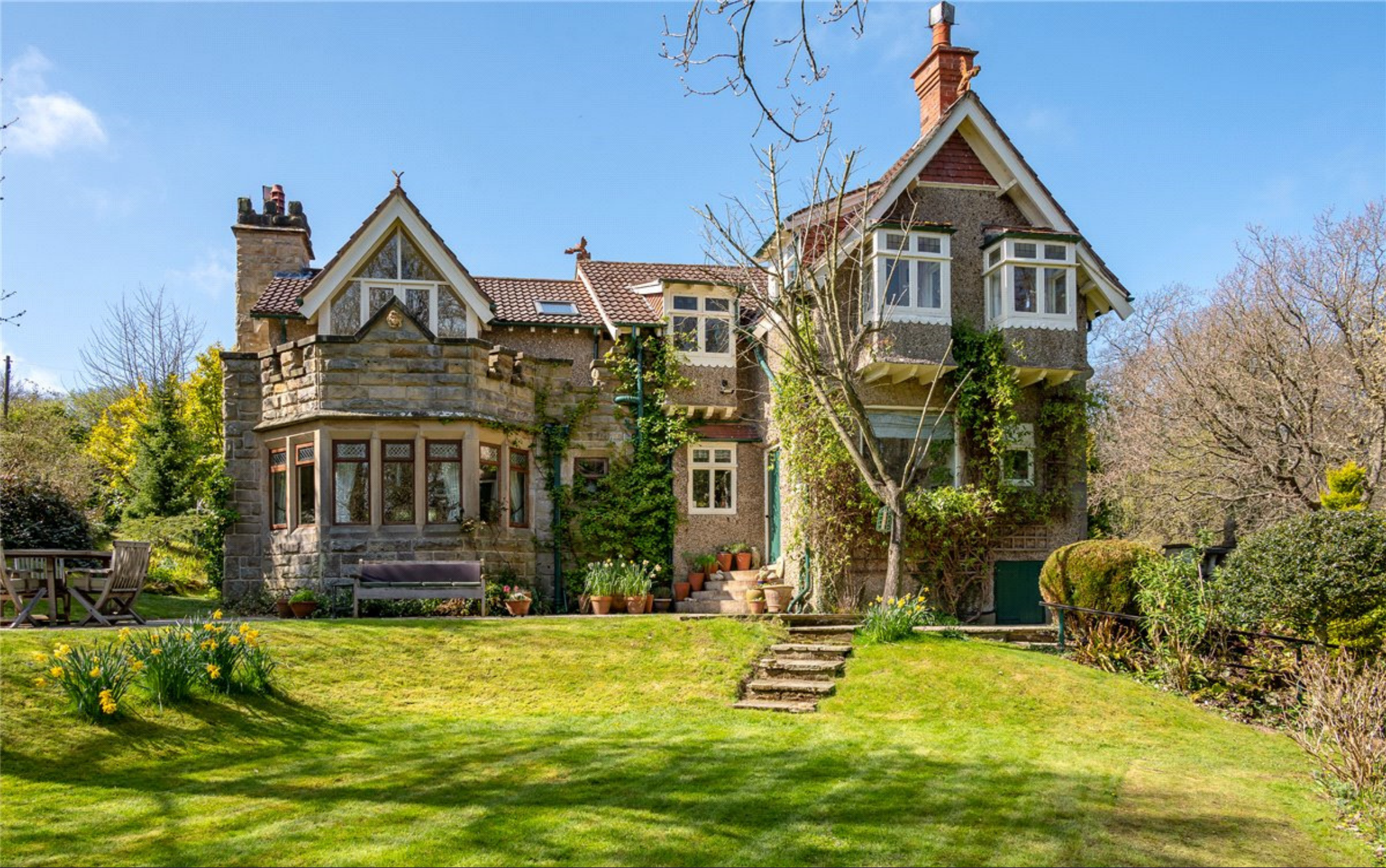
WYKE LODGE, STAINTONDALE ROAD, CLOUGHTON GUIDE PRICE £795,000