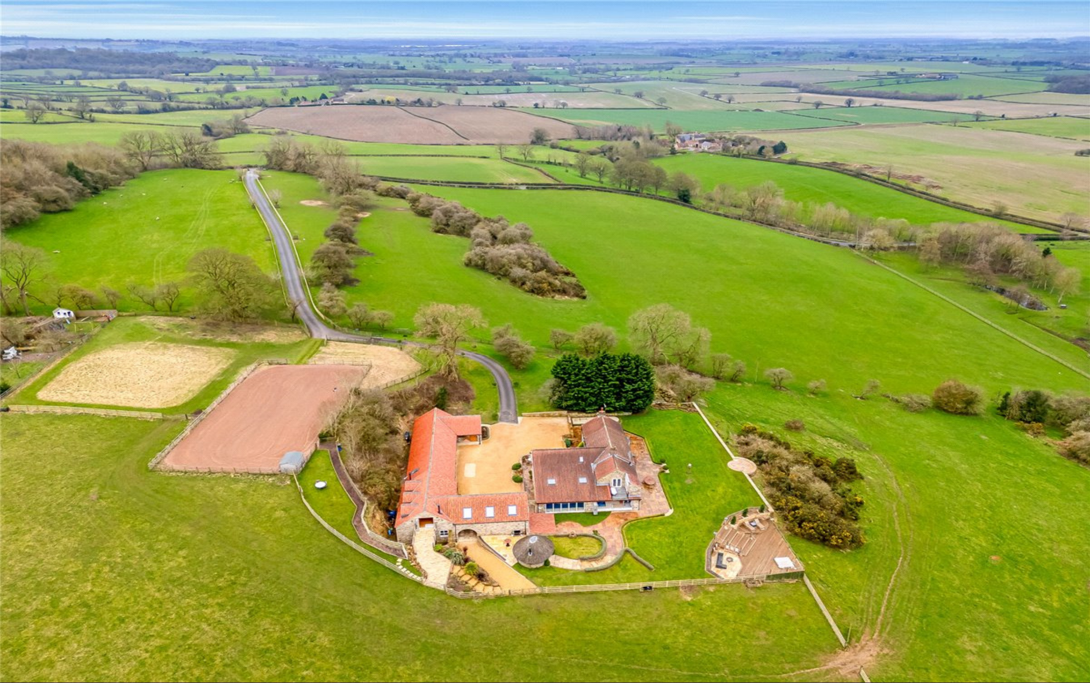
OSGOODBY COTTAGE, OSGOODBY, THIRSK £3,000,000