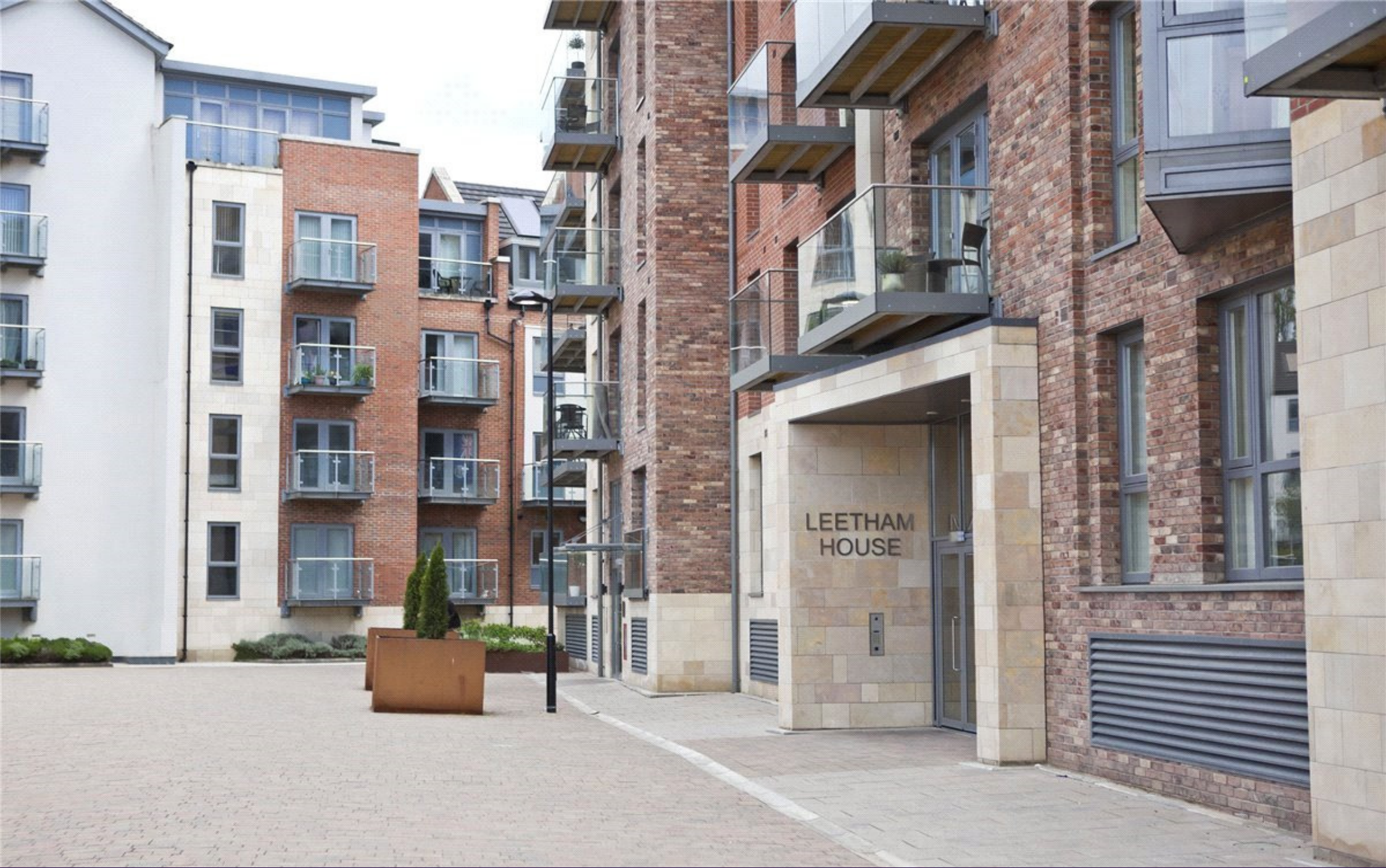
LEETHAM HOUSE, POUND LANE, YO1 7PB £250,000