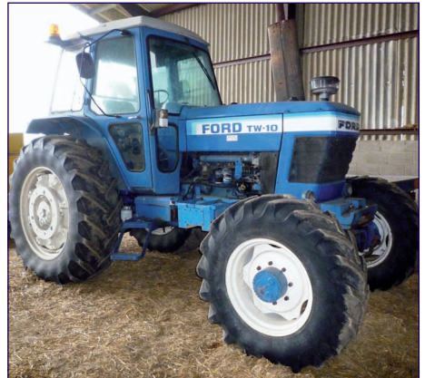
Lot No 204