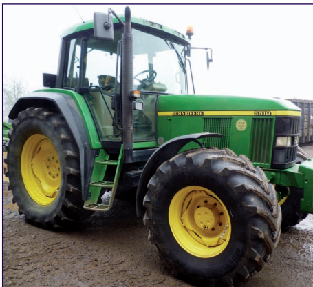
Lot No 205