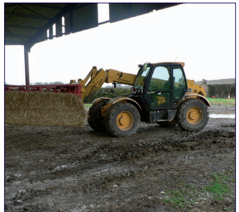
Lot No 206