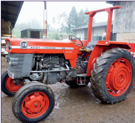
Lot No 202