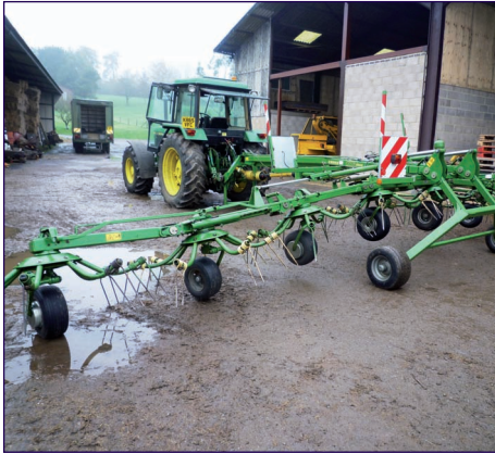
Lot No 197