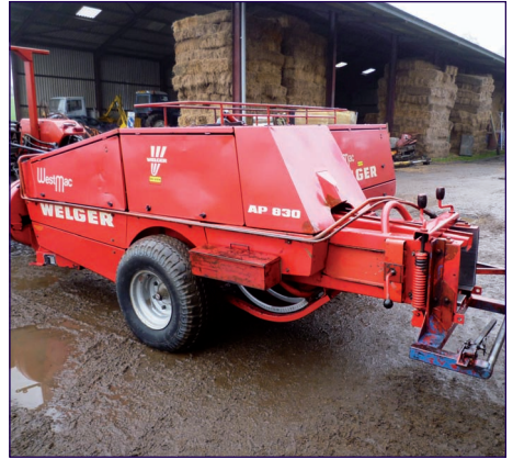
Lot No 199