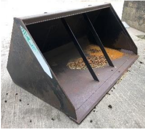
356 Albutt Grain Bucket