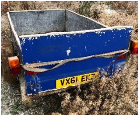
339 Small Car Trailer