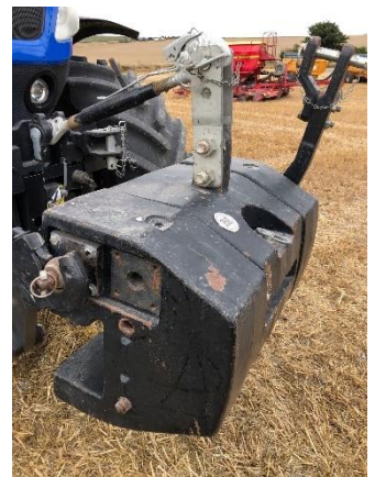
359 NH Case 1000kg Front Weight