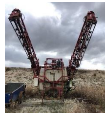
338 Spray Care 1000/24 Sprayer (spares or repair)