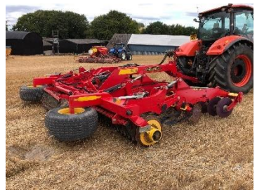
345 Vaderstad 500 5m Carrier (approx 2008 - yr S)