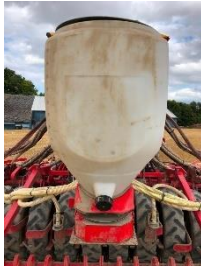
349 Slug Pelleter Drill Attachment