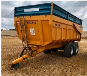
351 Rolland DM013 Twin Axle Turbo 140 Grain Trailer c/w Sprung Draw Bar & Axle, Hydraulic Tail Gate (SN: 1310529)