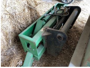
334 McHale Bale Squeeze & Spike (Hydraulic) (2003)(SN 353 335)