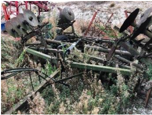
336 Green 4m Hydraulic Trailed Disc (1980s)