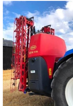
358 Vicon Ixter B18 1800 litre 24m Sprayer (2019) Triple Nozzle Body, Auto Section & Isobus (approx 2 seasons use)