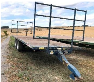
353 Marston BTC12 28ft Twin Axle Bale Trailer c/w Hydraulic Brakes