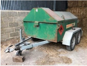
333 Major Bunded 1000 litre Twin Axle Diesel Bowser c/w Elec Pump & Gun (2003)(Auto Shut Off)