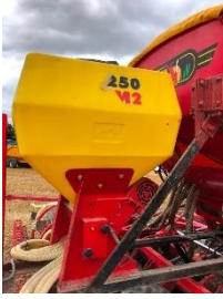
348 KRM Avadex 250 Drill Attachment