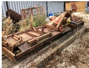
337 Kuhn 4m Power Harrow & Transport Low Loader Trailer (1988)