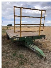
354 Warwick Twin Axle 28ft Bale Trailer (2002)