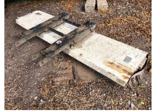
306 Cherry Products CAB02 Bag Lifter (2021) (SN: CP2942)