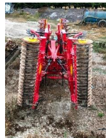
346 Vaderstad Top Down 500 5m (Approx 2008 - Year S)(New Disc 2021)