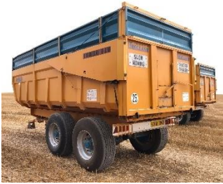
350 Rolland DM013 Twin Axle Turbo 140 Grain Trailer c/w Sprung Draw Bar & Axle, Hydraulic Tail Gate (SN: 1310528)