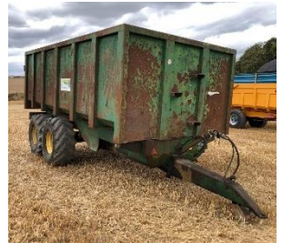
352 Warwick 11T Twin Axle Manual Tail Gate Grain Trailer (1985)