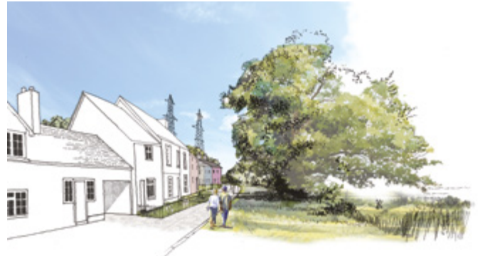
LAND AT EARLS COLNE, ESSEX