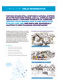
Urban regeneration projects