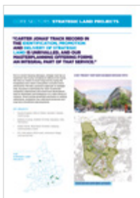
Strategic land projects