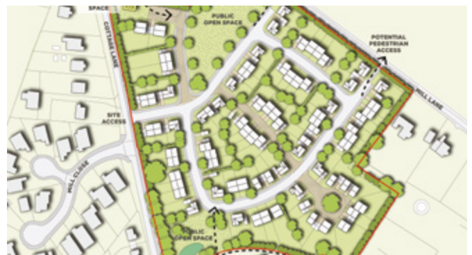
LAND AT WESTFIELD, SUSSEX