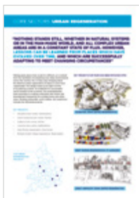
Urban regeneration projects