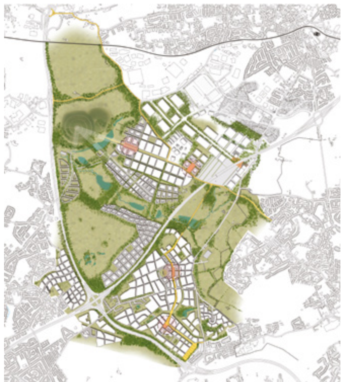
MANCHESTER NORTHERN GATEWAY