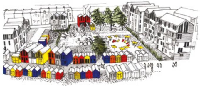
WEST MARINA REGENERATION, ST LEONARDS