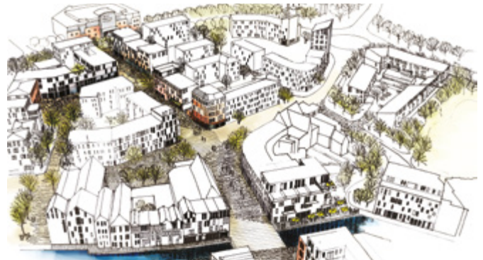
NUNEATON TOWN CENTRE REGENERATION