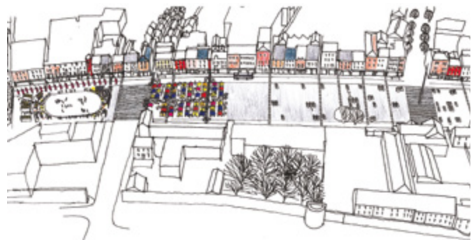
GREAT YARMOUTH TOWN CENTRE REGENERATION