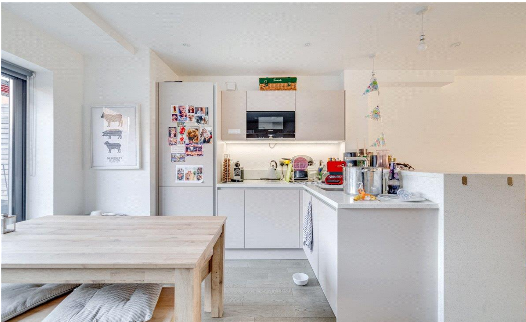
HARLOW GARDENS, KINGSTON UPON THAMES, KT1 £2,995 per month*