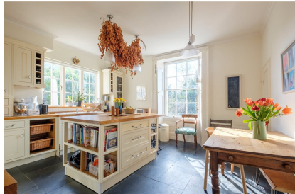
Perrymead Court, Perrymead, Bath

Total area: approx. 94.7 sq. metres (1018.8 sq. feet) Every attempt has been made to ensure the accuracy of this floor plan, however measurement of doors, windows, rooms and any other items are approximate and no responsibility is taken for any error or omission. This plan is for illustrative purposes only and should be used as such by any prospective purchaser. Drawn in accordance with RICS guidelines. www.rphoto.co.uk Plan produced using PlanUp.