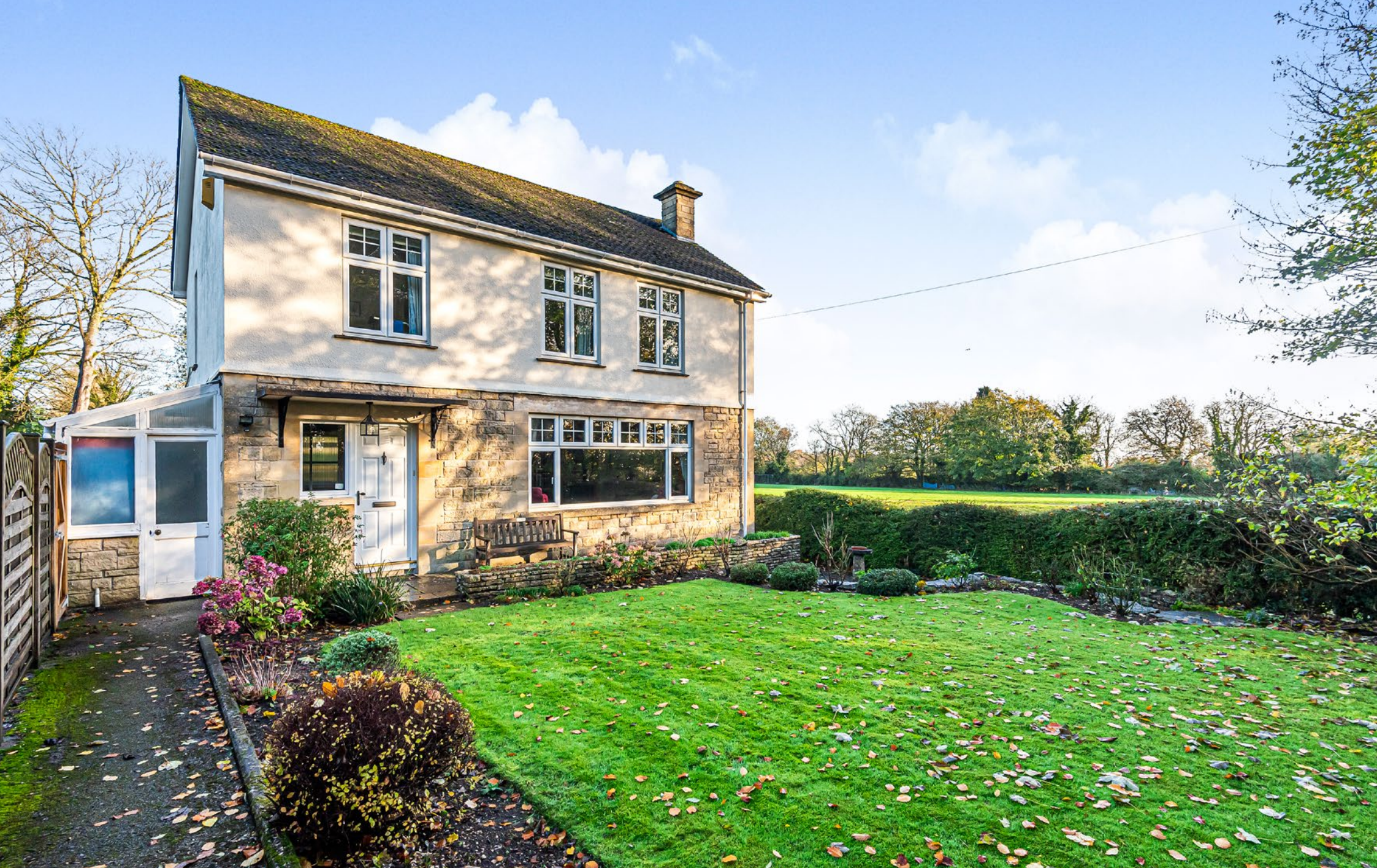
CELTIC FIELDS COTTAGE Claverton Down, Bath