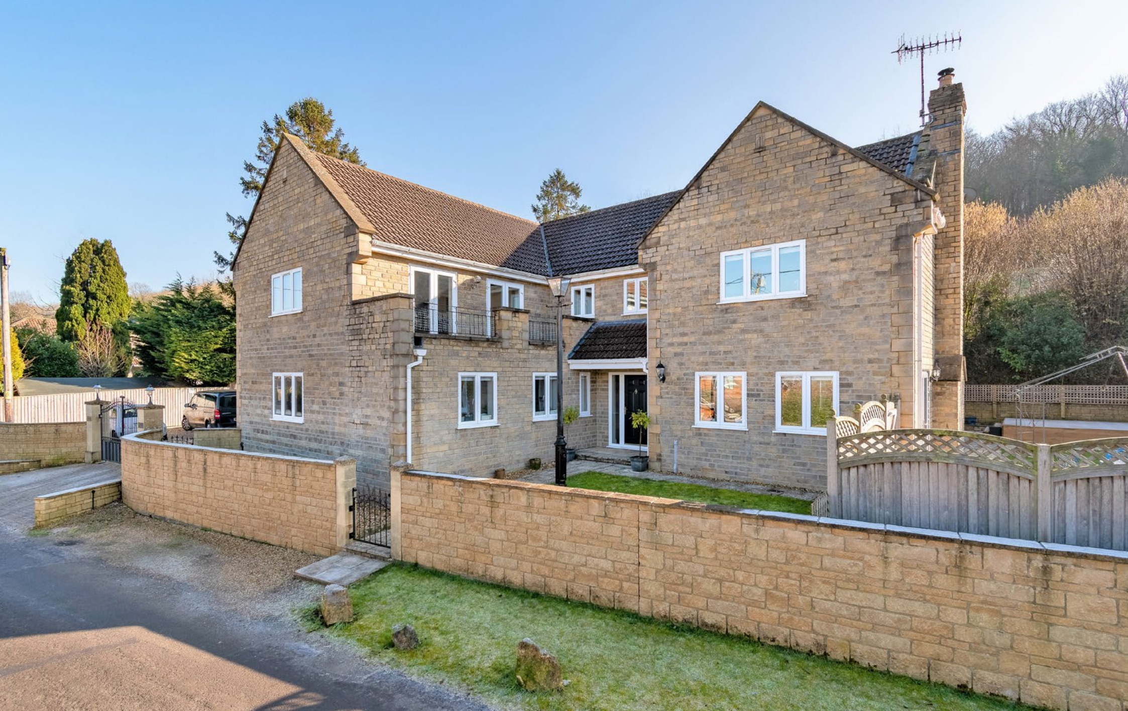
PASSFORD HOUSE Kingsdown