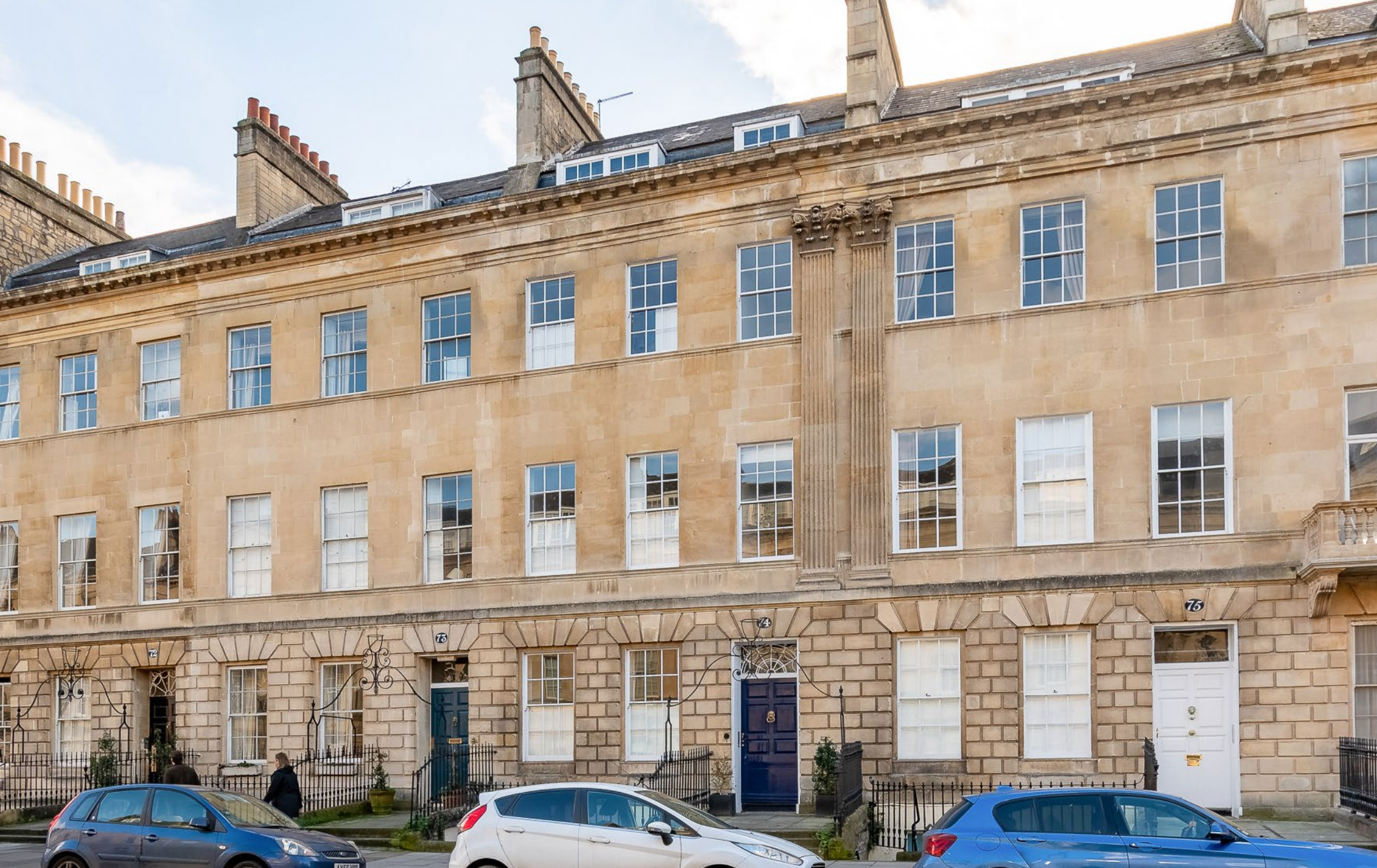
74 GREAT PULTENEY STREET Bath