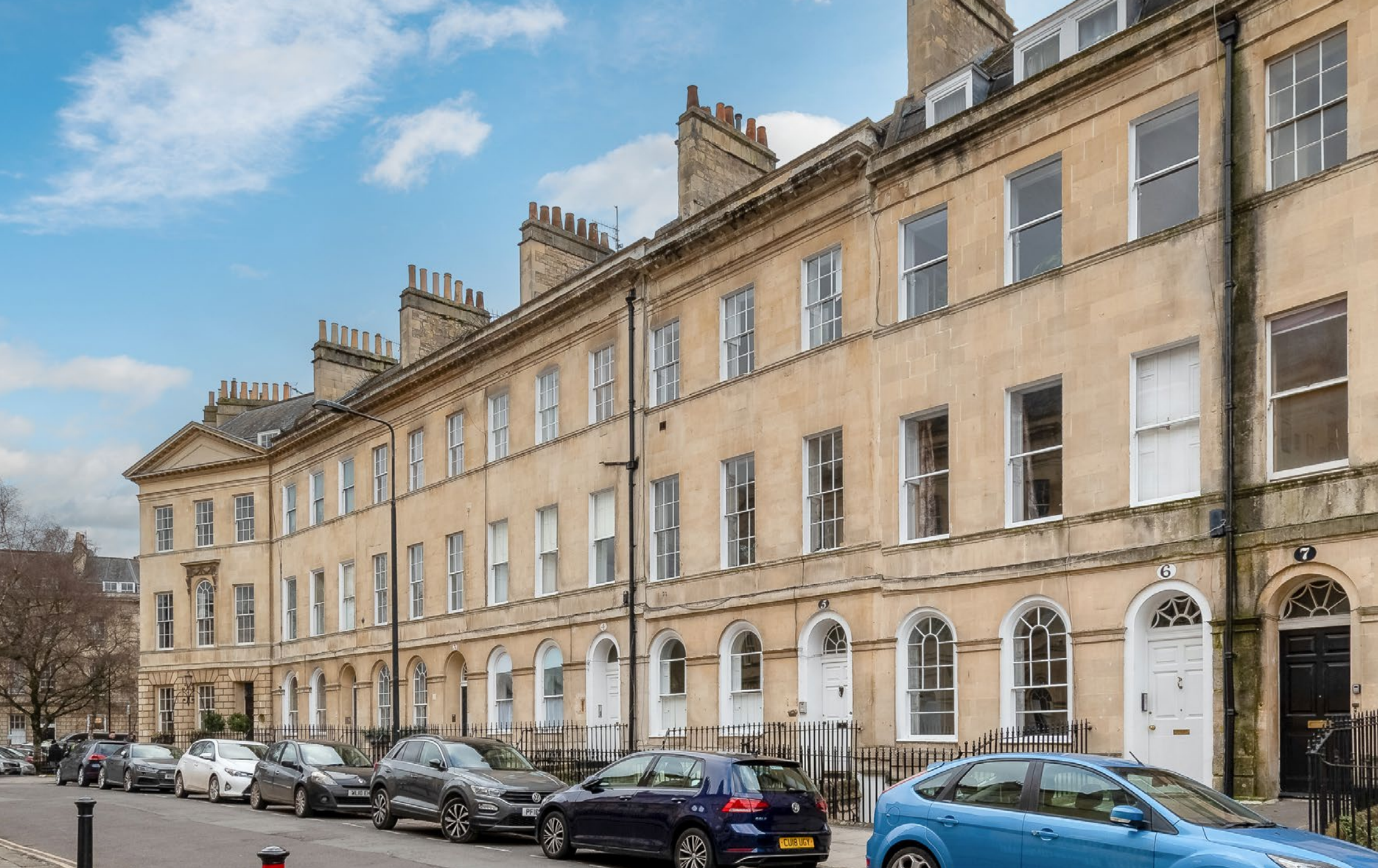
6 HENRIETTA STREET Bath