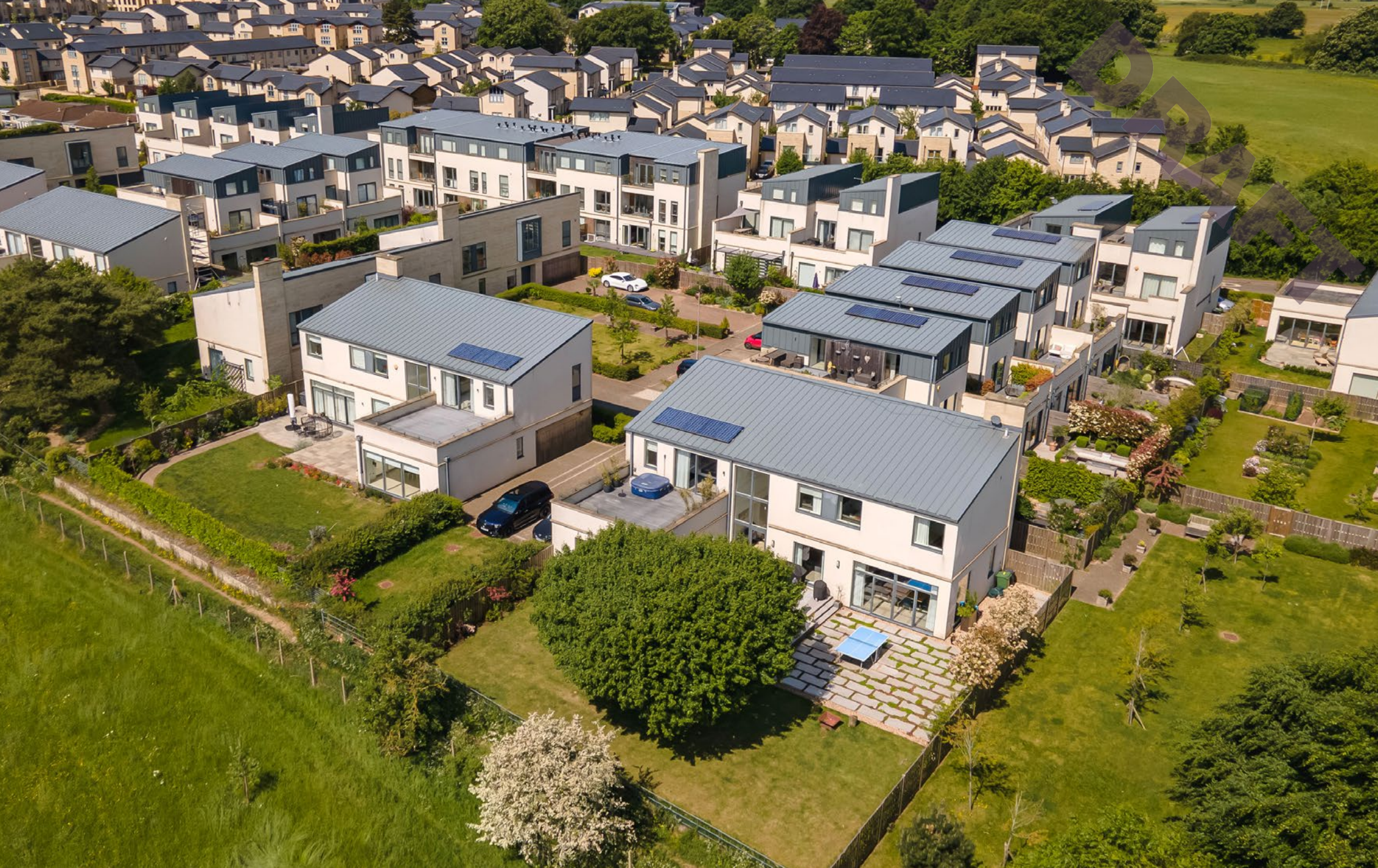
5 LANSDOWN SQUARE EAST Lansdown, Bath BA1 9DS