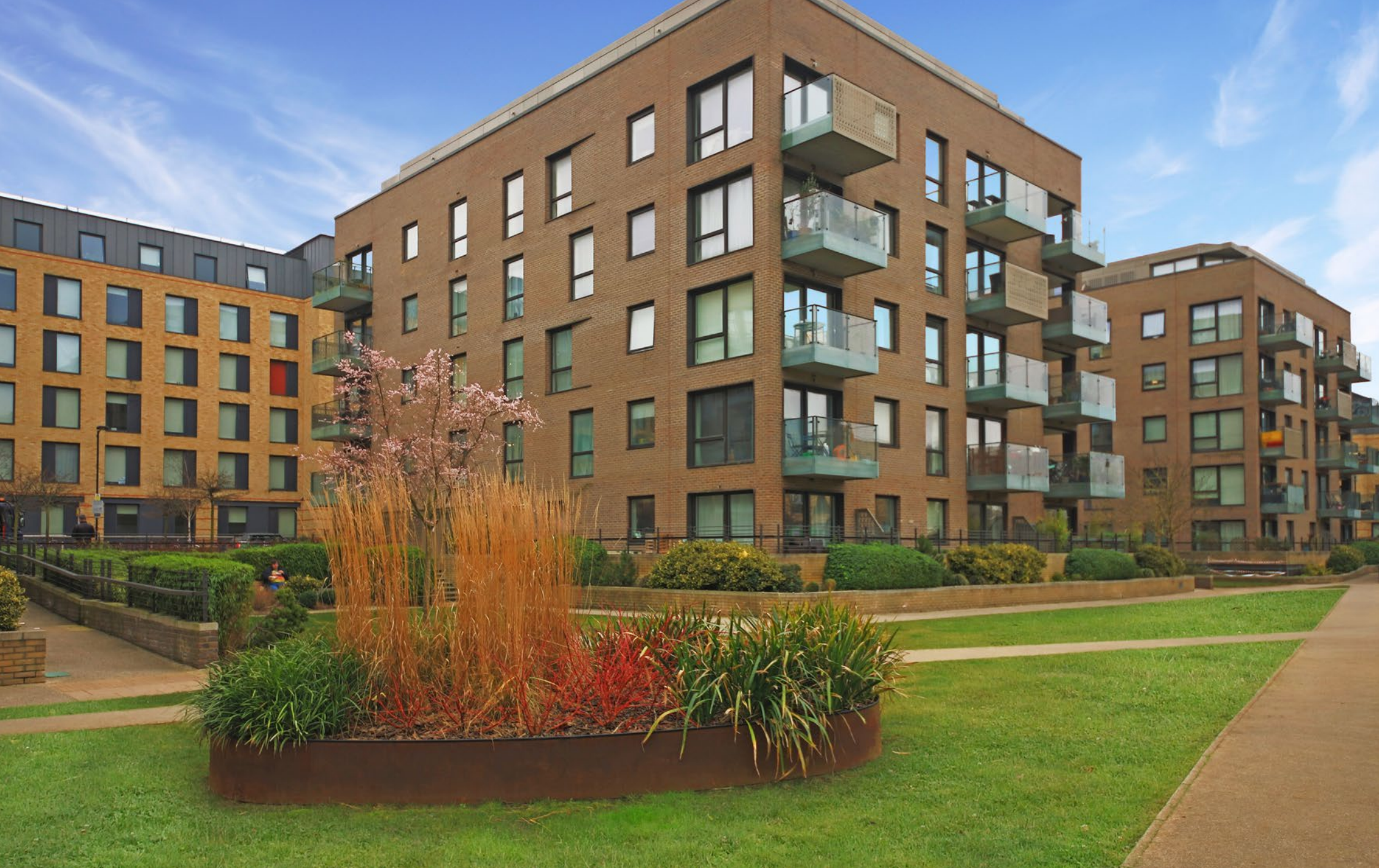
26 GILBERT HOUSE 6 Mill Park, Cambridge