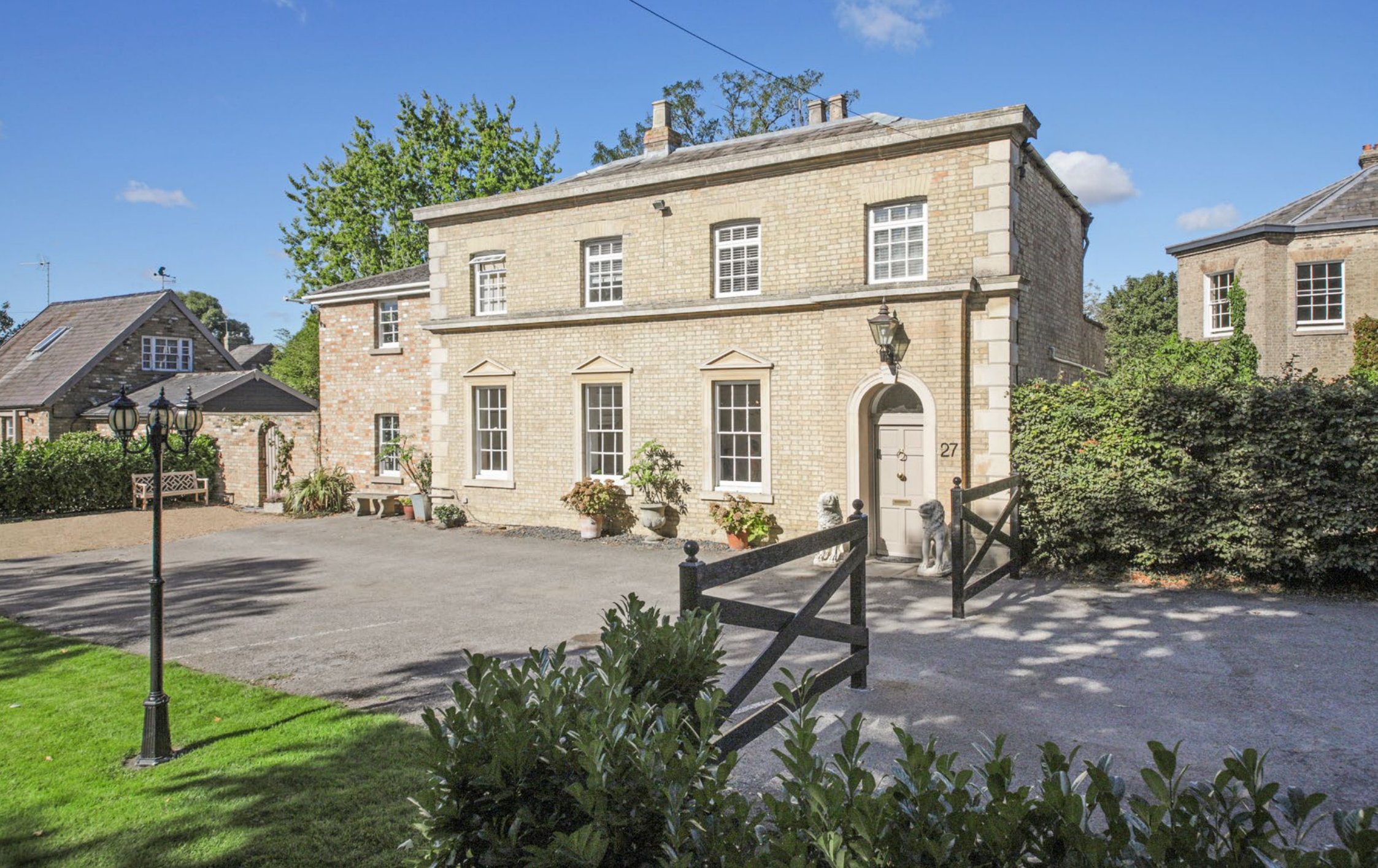
BRAYWOOD HOUSE, 27 ST PETERS ROAD Huntingdon