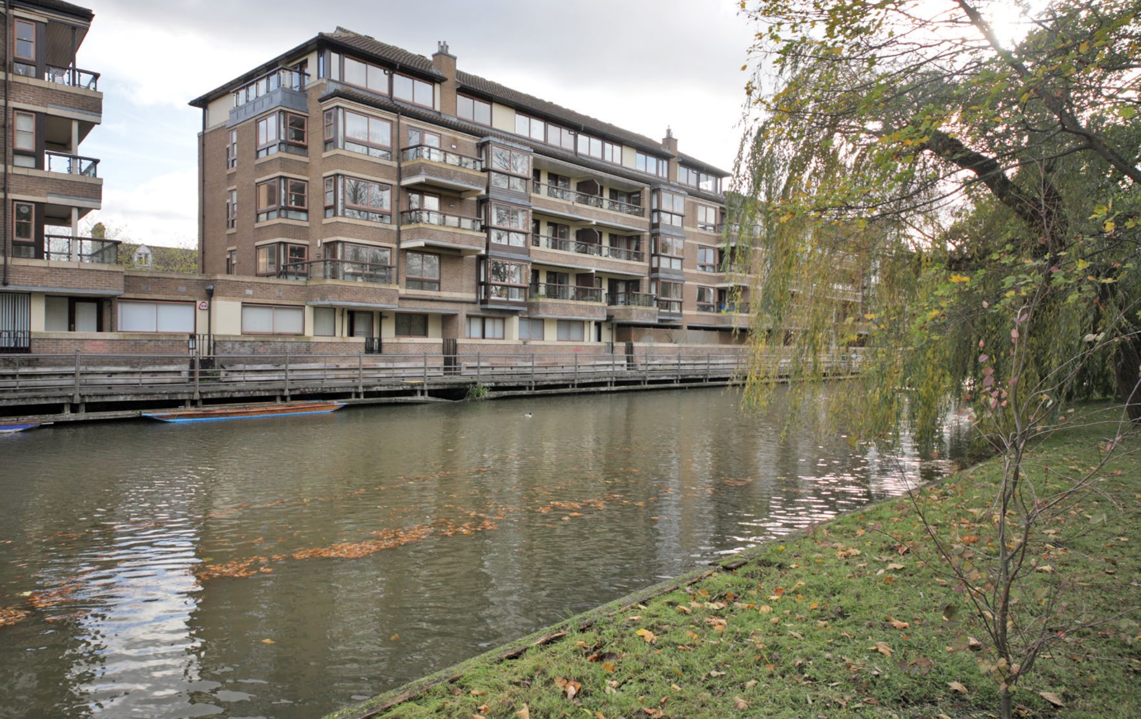
27 BEAUFORT PLACE Thompsons Lane, Cambridge