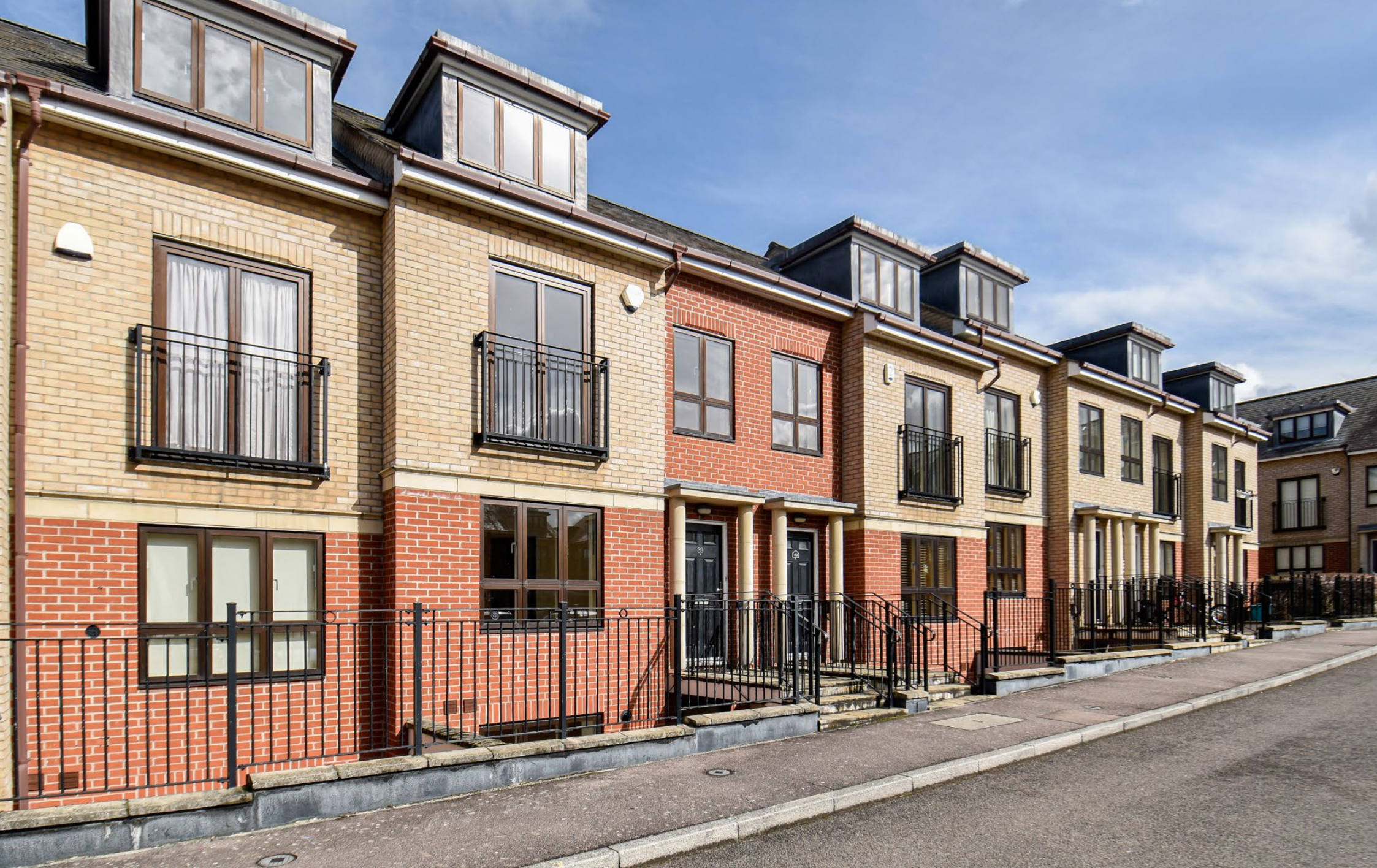
ST BARTHOLOMEWS COURT Cambridge