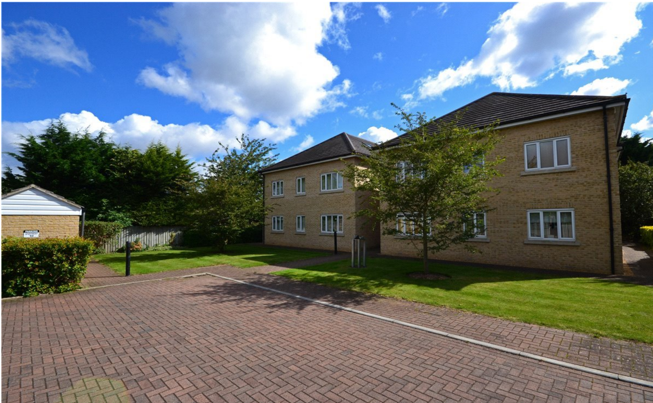
BROOKWOOD HOUSE, 226A HISTON ROAD, CB4 £1,150 per month*