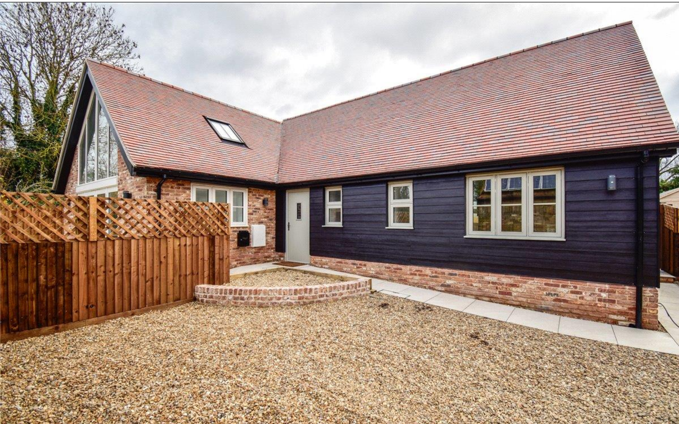
MEADOW VIEW COTTAGE, HORSEWARE, OVER, CB24 £675,000