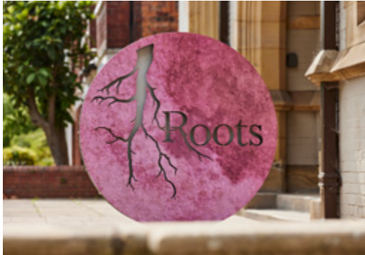
Roots York, Marygate