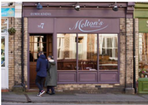
Melton's, Scarcroft Road