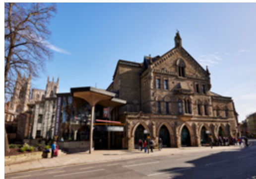
York Theatre Royal