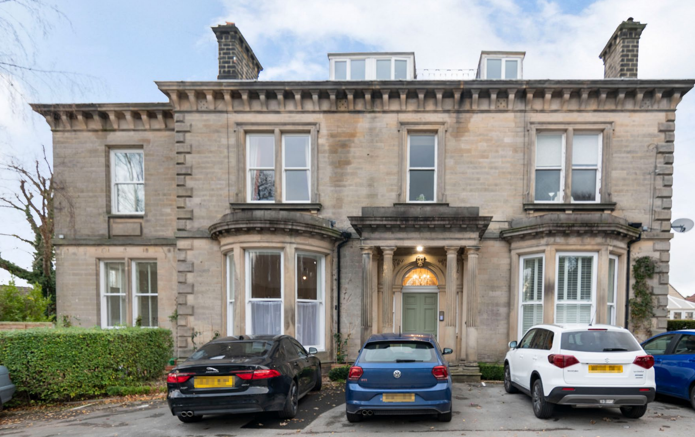
FLAT 2, HARLOW GRANGE Harrogate