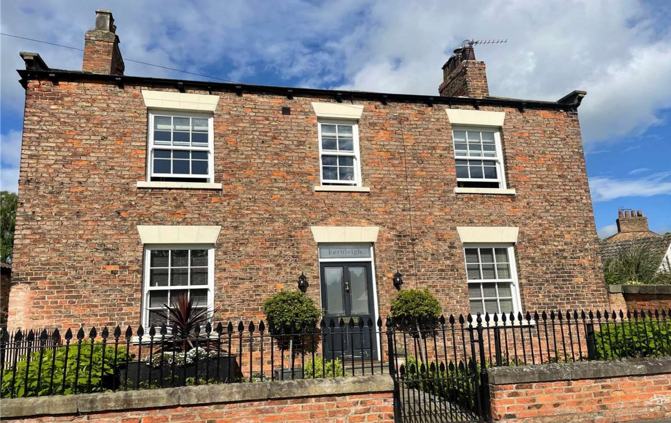
FERNLEIGH, FRONT STREET, ALDBOROUGH, YORK, NORTH YORKSHIRE, YO51 9ES £2,600 per month