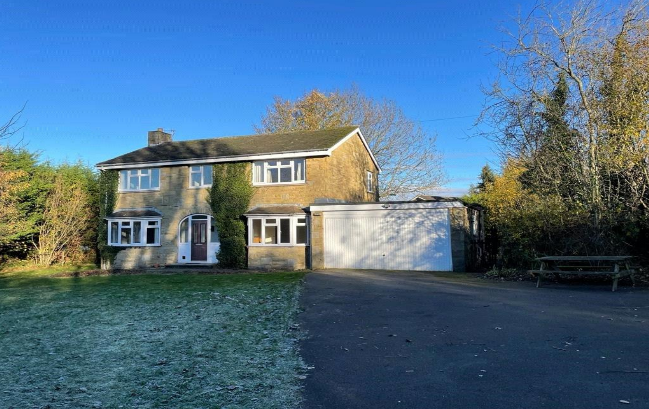
THE VICARAGE, OLD POOL BANK, POOL IN WHARFEDALE, OTLEY, LS21 1EJ £1,600 per month