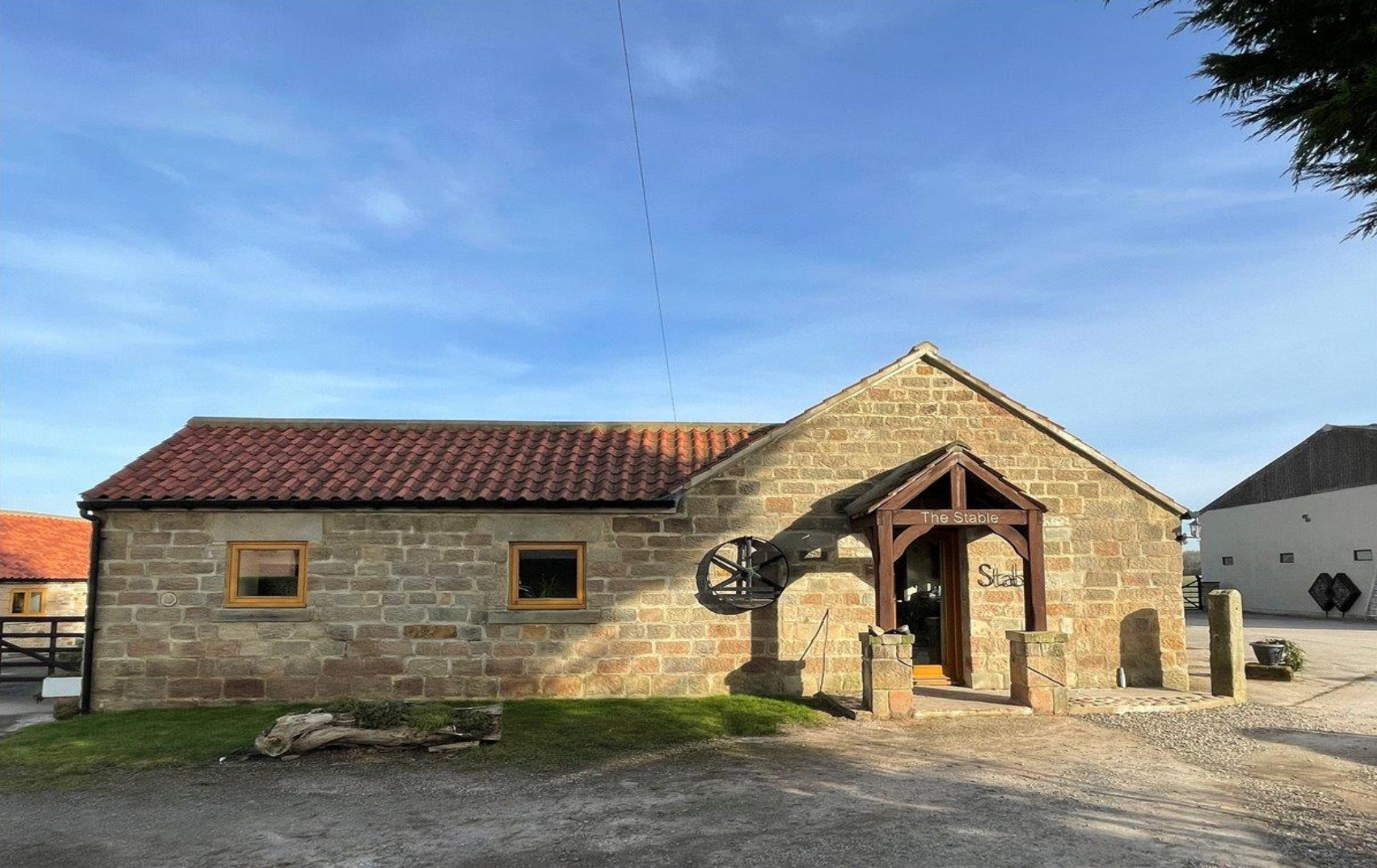
THE STABLE, THISTLE HILL FARM, KNARESBOROUGH, NORTH YORKSHIRE, HG5 8LS £1,400 per month