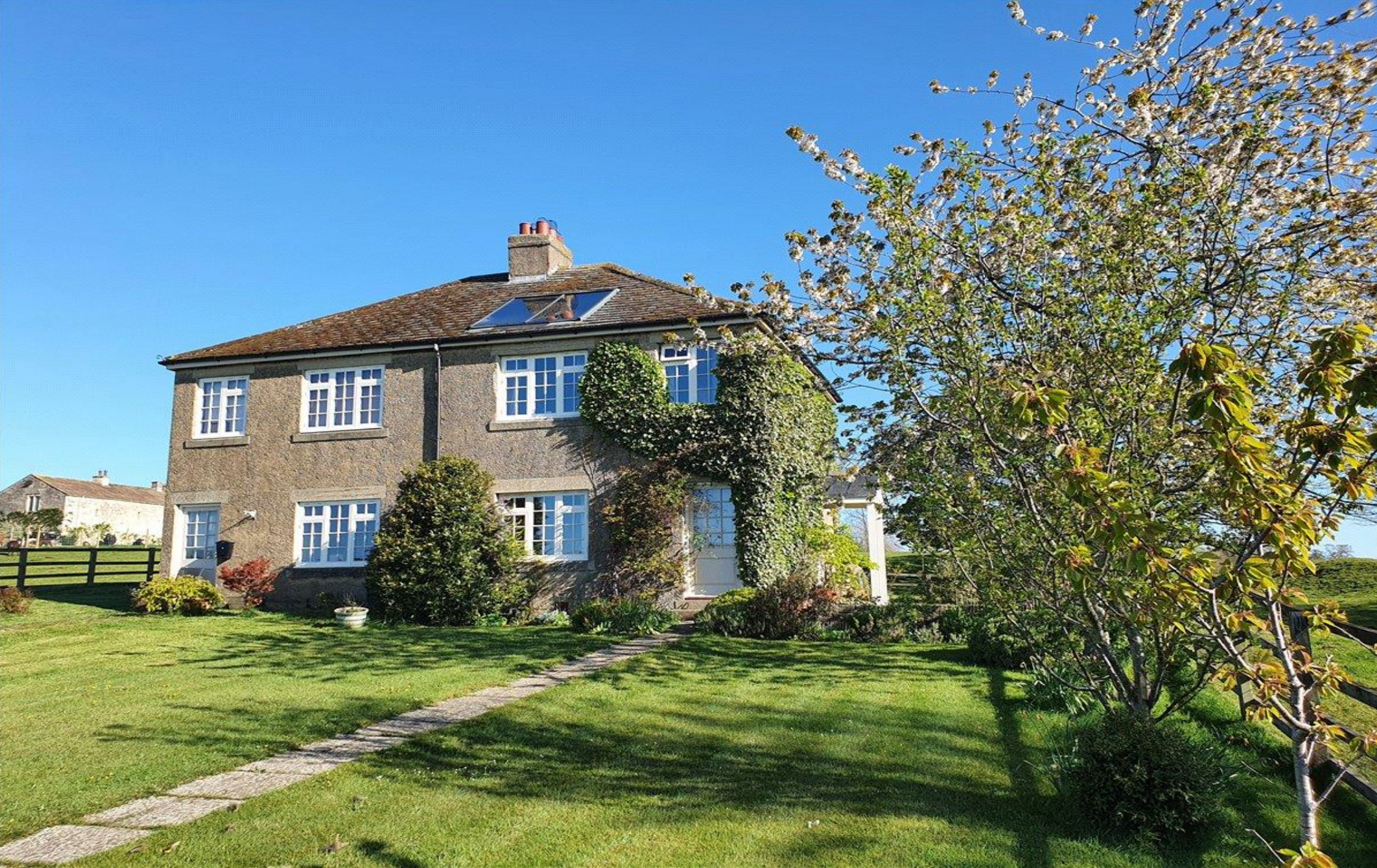
1 MARKENFIELD HALL COTTAGE, RIPON, NORTH YORKSHIRE, HG4 3AD £925 per month