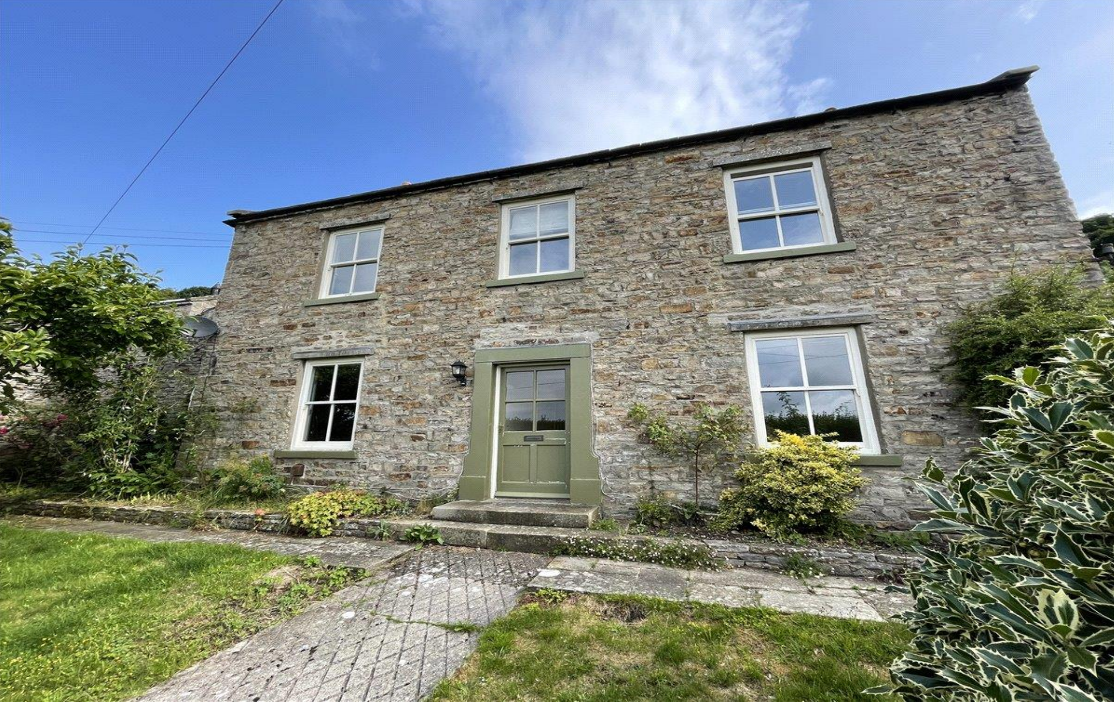
PRESTON MOOR FARMHOUSE, PRESTON UNDER SCAR, LEYBURN, DL8 4AJ £1,850 per month