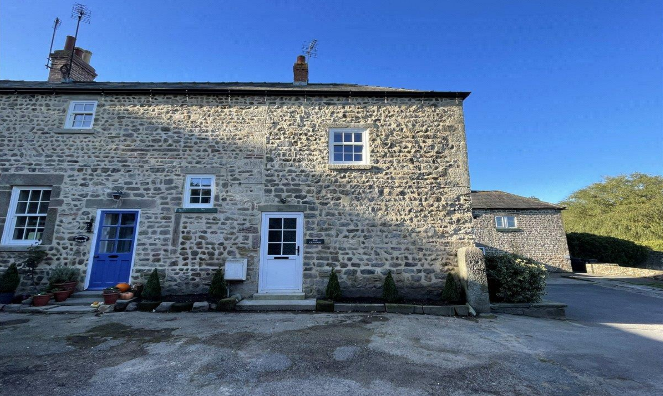
THE GRANARY, HOB GREEN ESTATE, MARKINGTON, HARROGATE, HG3 3PJ £895 per month