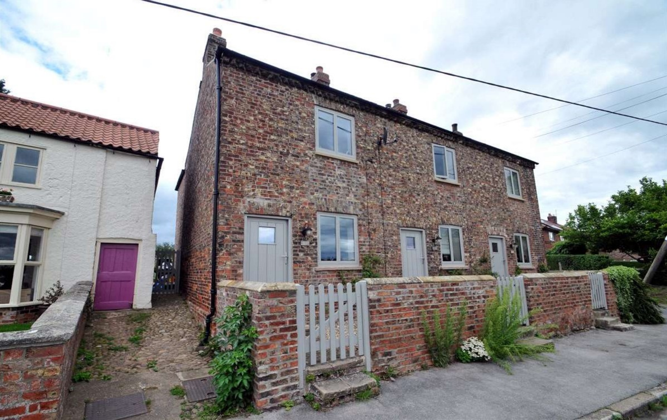
3 THE COTTAGES, KIRK HAMMERTON, YORK, NORTH YORKSHIRE, YO26 8BY £1,250 per month