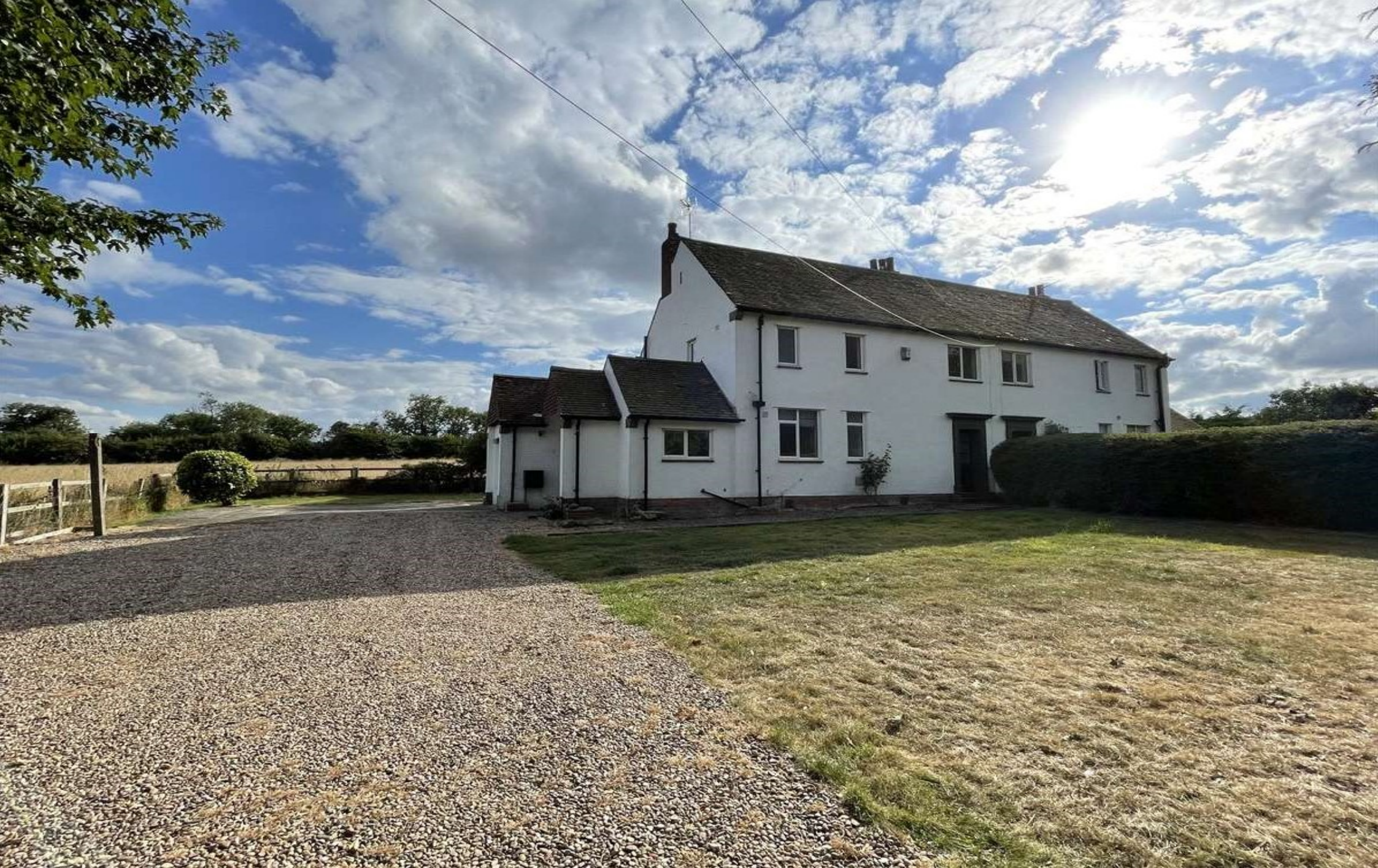
WOODGATE COTTAGE, MOOR ROAD, BISHOP MONKTON, RIPON, HG3 3QF £1,250 per month