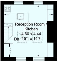
First Floor 215 sq ft / 20 sq m