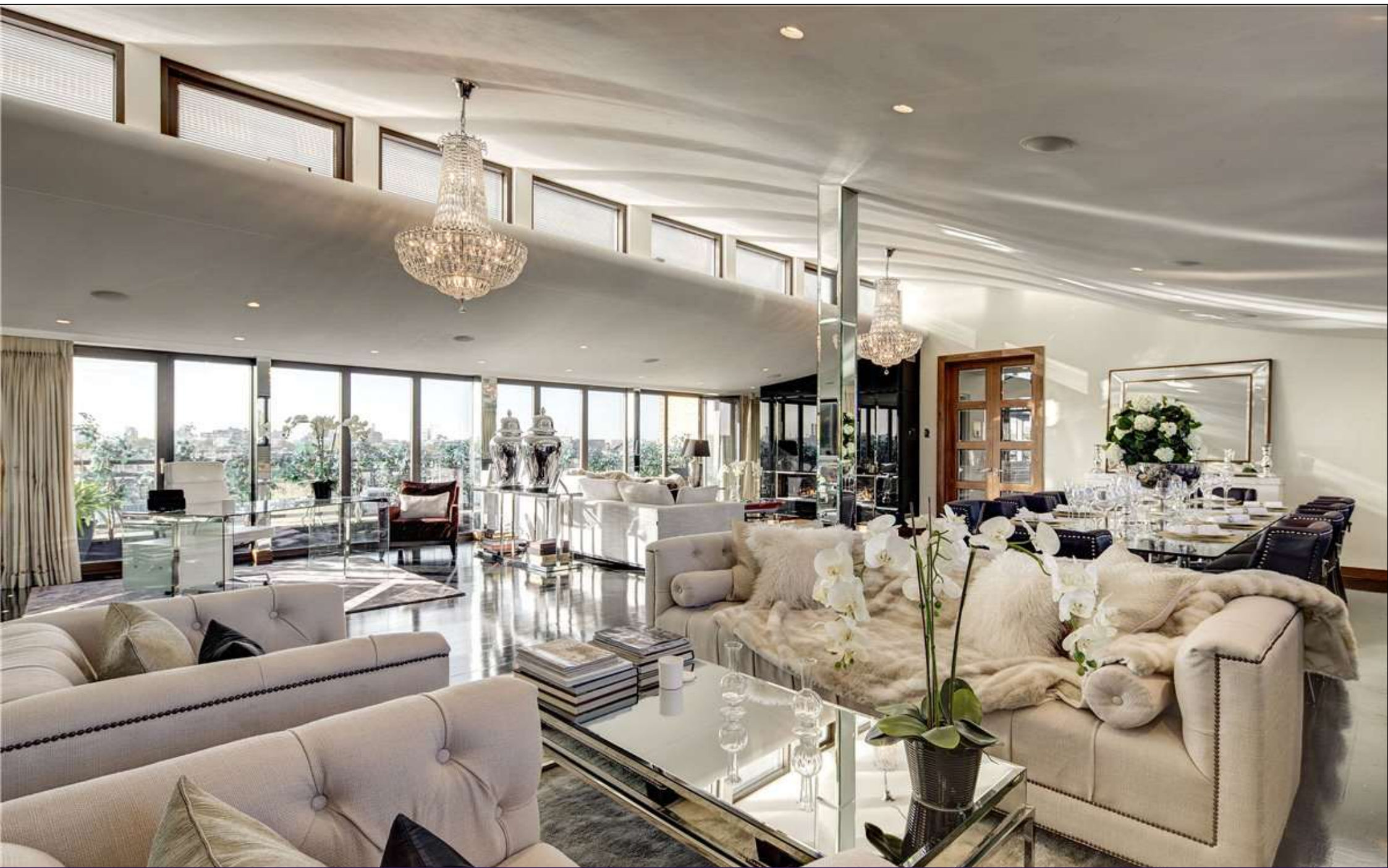
PETERSHAM HOUSE, HARRINGTON ROAD, SW7 £7,250,000