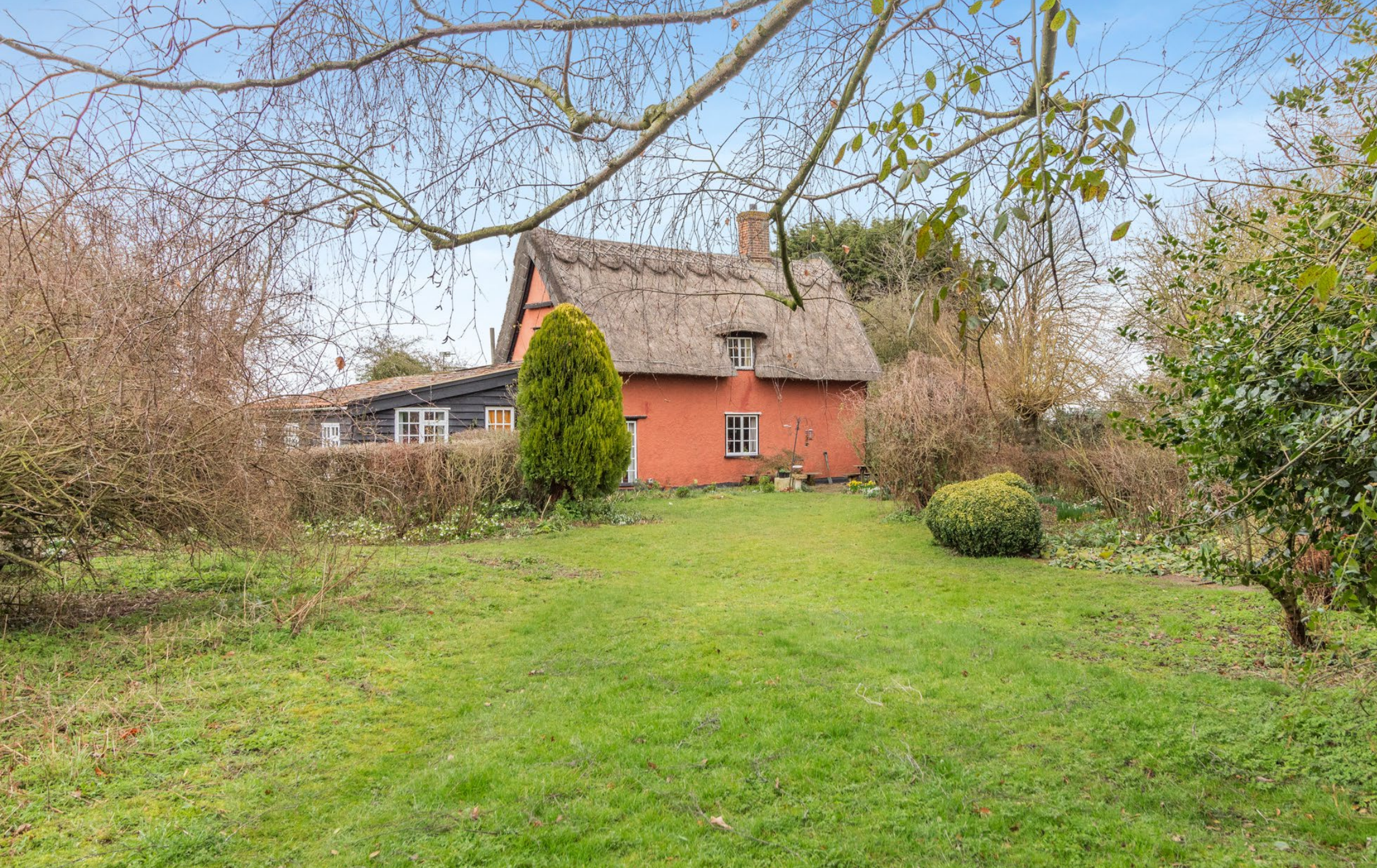
MONKS PARK COTTAGE Felsham, Suffolk