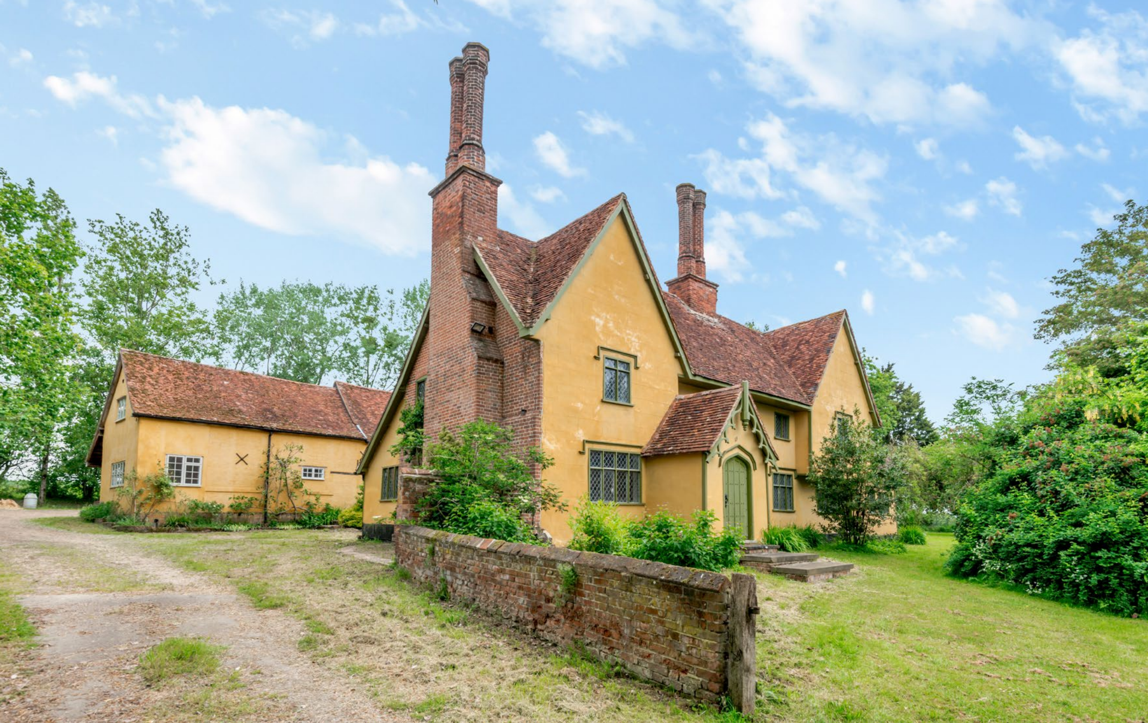
BRIDGE STREET FARM HOUSE Bridge St. Long Melford, Suffolk