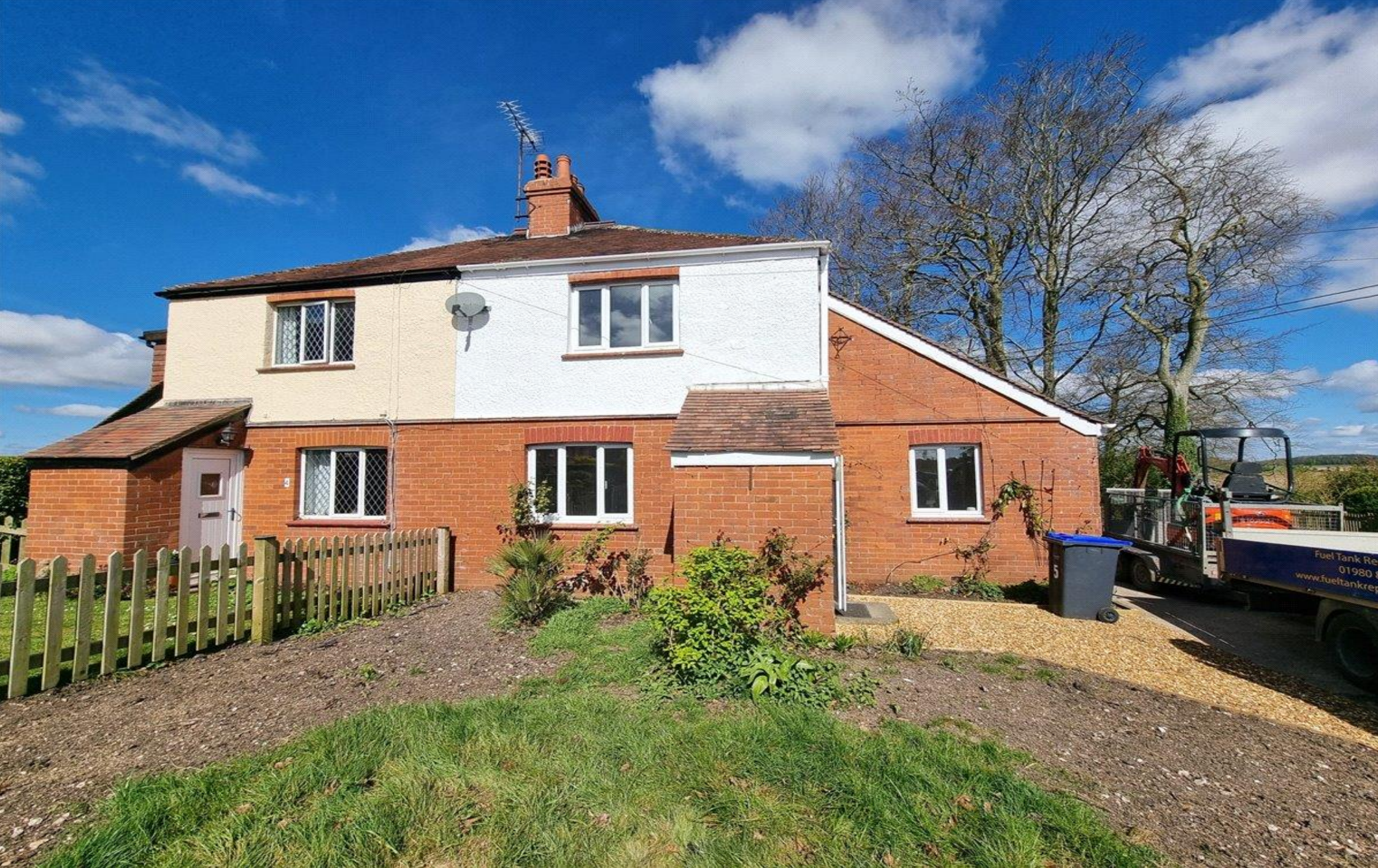
DRUIDS LODGE, SALISBURY, SP3 £1,000 per month*