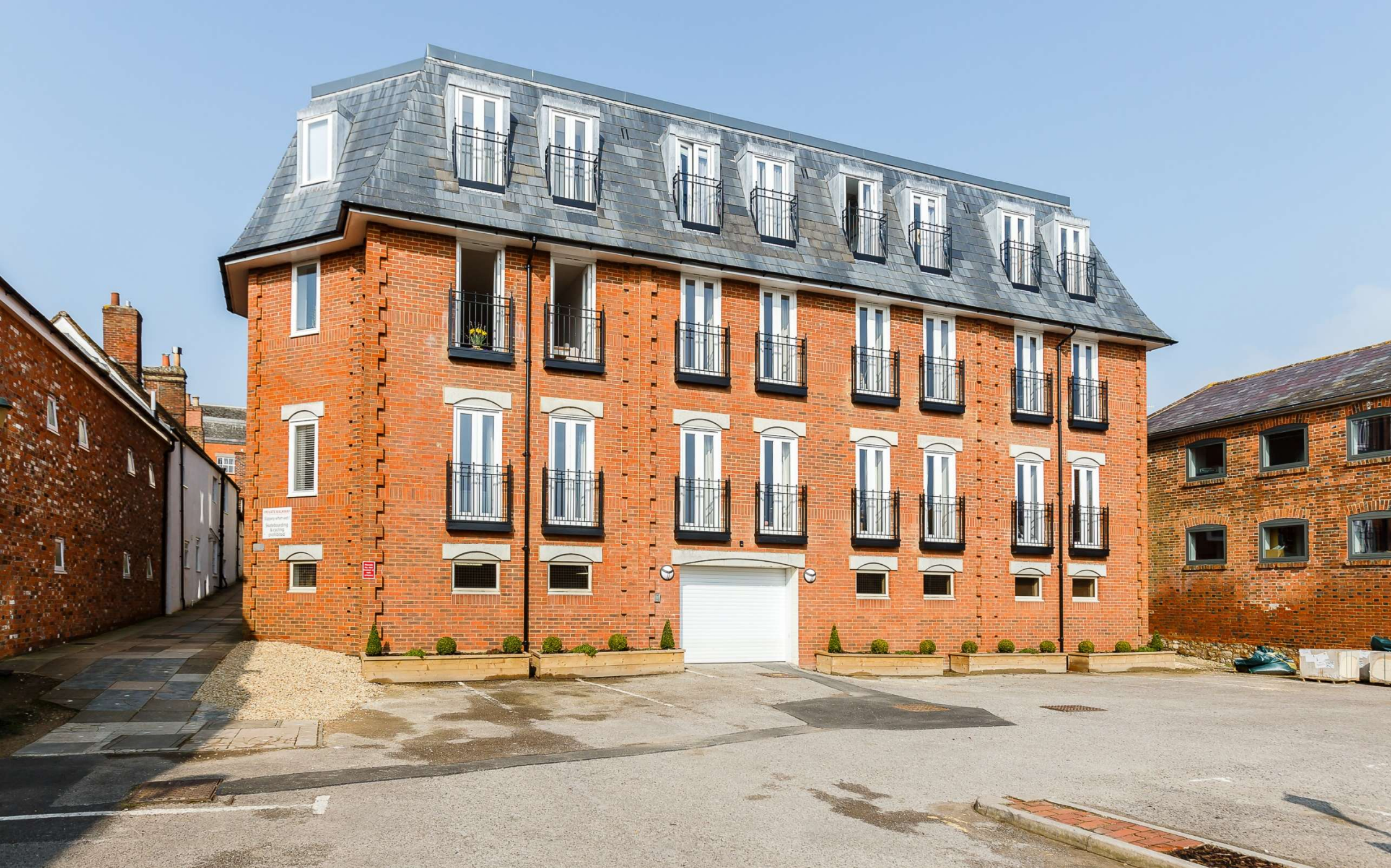
CARDIGAN HOUSE, MARLBOROUGH