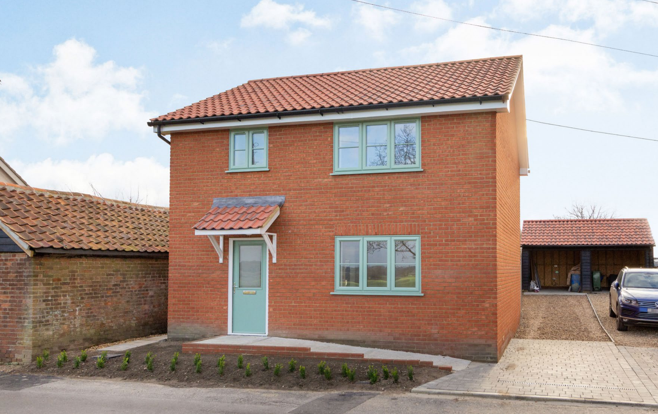
MEADOW VIEW COTTAGE Gestingthorpe, Essex