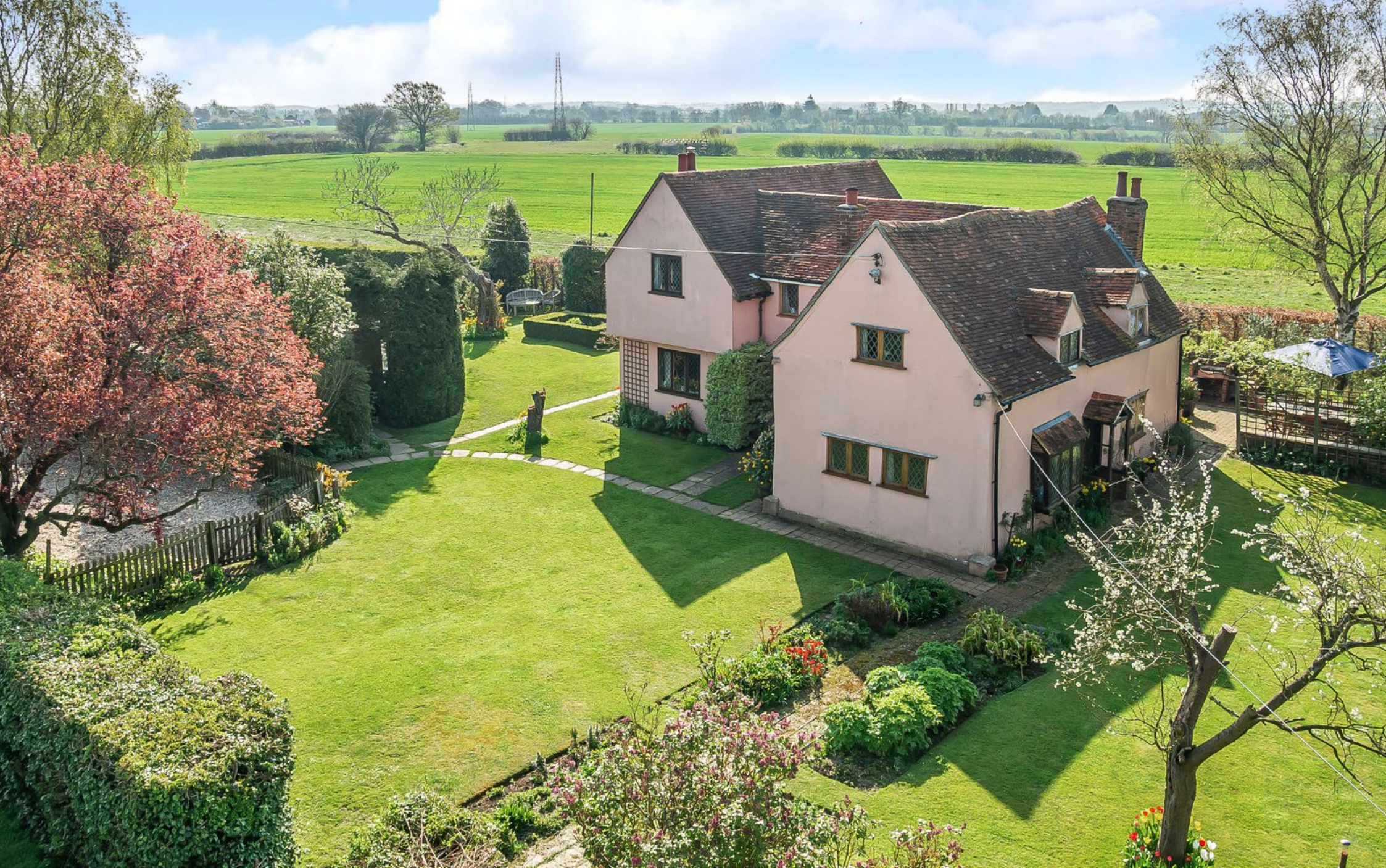
THE OLD COTTAGE Skye Green, Feering, Essex