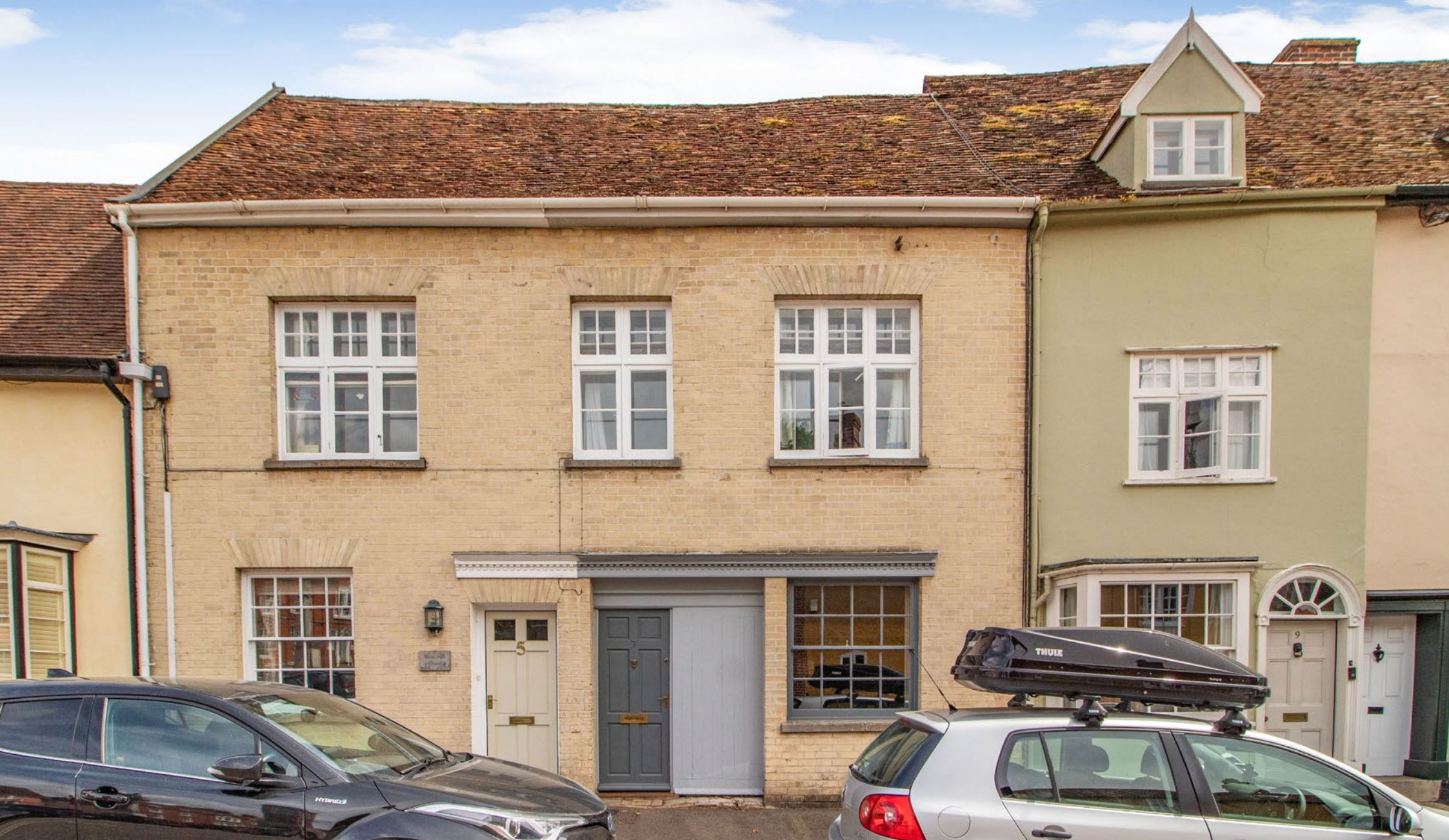
TUDOR COTTAGE Bildeston, Suffolk