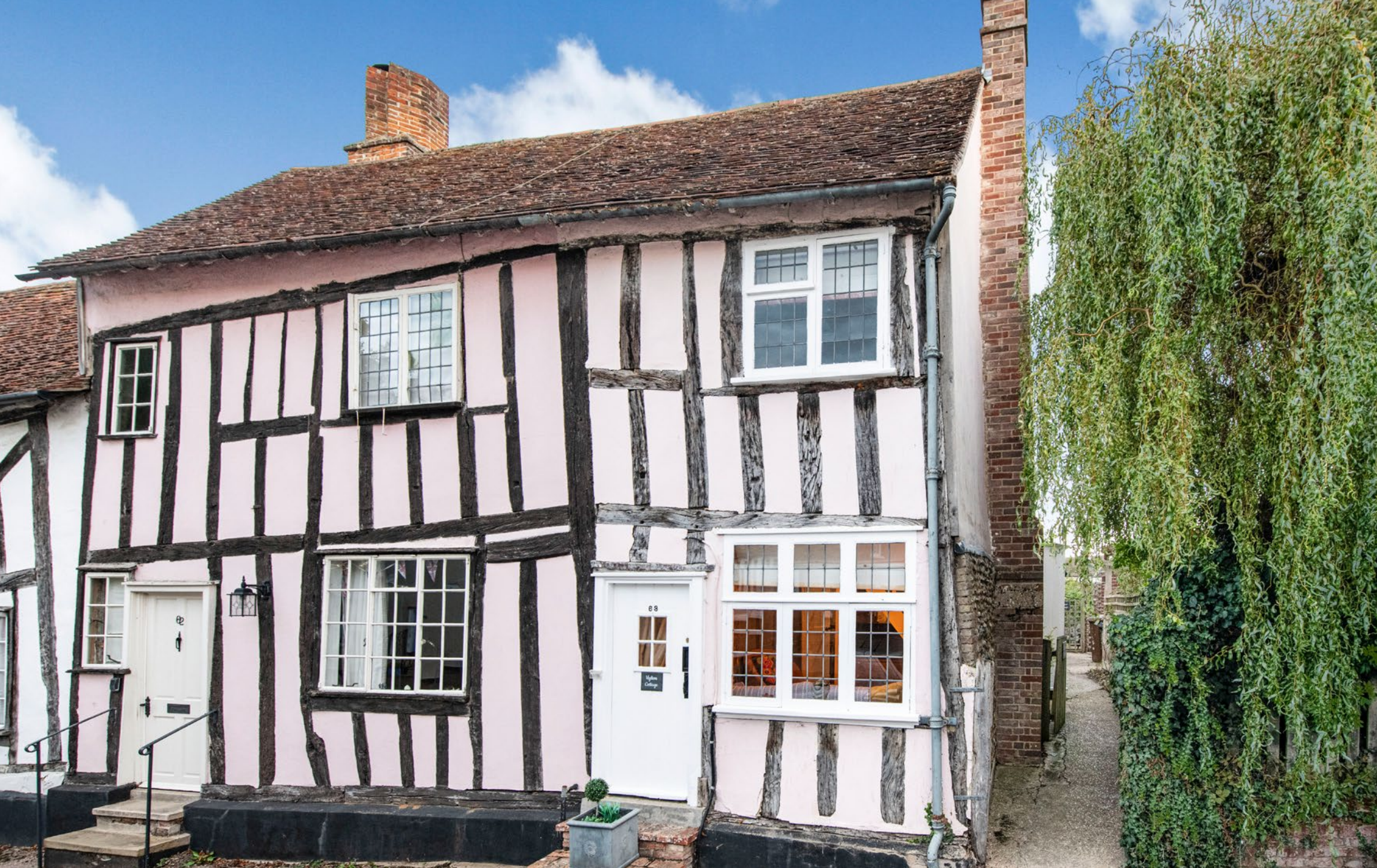
63 HIGH ST Lavenham, Suffolk