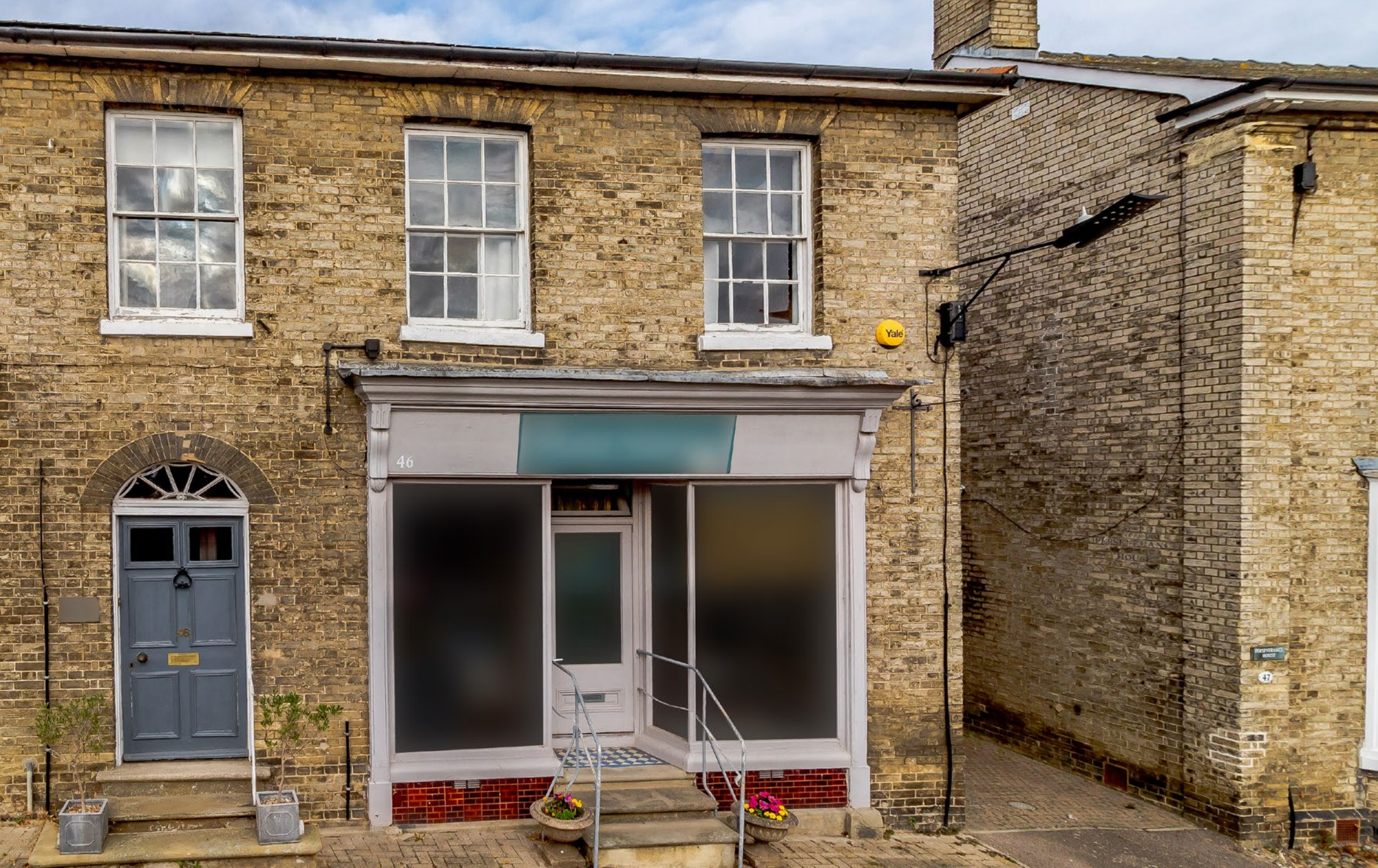
46 HIGH ST Lavenham, Suffolk